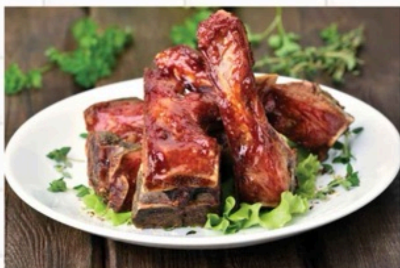
Meaty Pork Shoulder Country Style Ribs family pk. small pk...$1.69 lb.