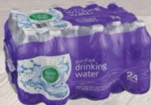
Food Club Drinking Water 24 pk., 16.9 oz.