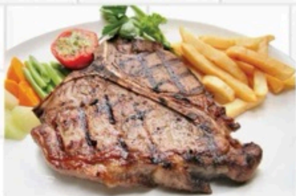
Select T-Bone Steaks preferred trim family pk. Single pk...$11.19 lb.