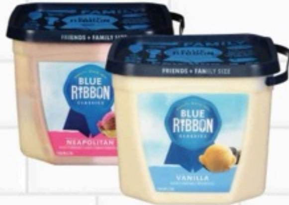
Blue Ribbon Classics Ice Cream Select Varieties 4 qt. pail