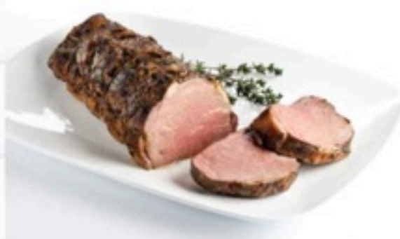
Whole Beef Tenderloin select, packer trim