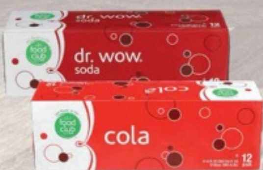
Food Club Sodas Select Varieties 12 pk., 12 oz.