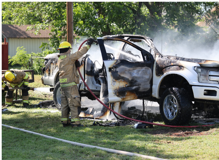
Hennessey Firefighters work to contain the fire parked close to structures.

Hennessey Police assisted at the scene.