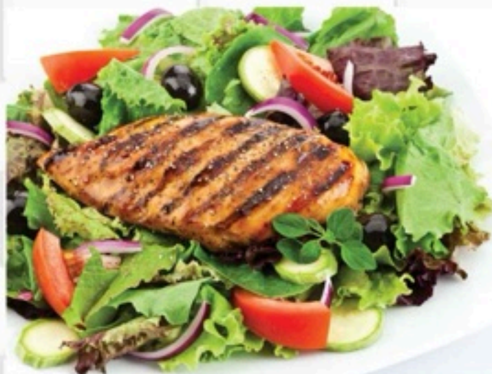
Boneless Skinless Chicken Breast previously frozen