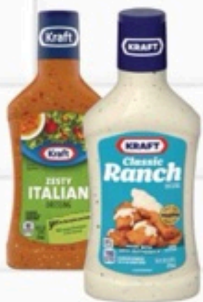
Kraft Salad Dressing Select Varieties 16 oz.