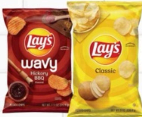
Lay's Potato Chips Select Varieties p.p. $4.29