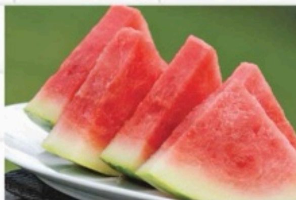
Seedless Watermelon new crop