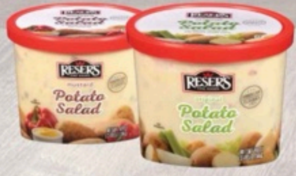
Reser's American Classics Coleslaw, Macaroni or Potato Salad Select Varieties 2.75-3 lb.