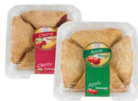
Cafe Valley Bakery Turnovers Cherry, Apple or Pineapple 4 ct.