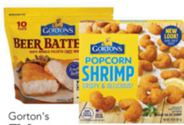
Gorton's Fish or Popcorn Shrimp Select Varieties 14-19 oz.