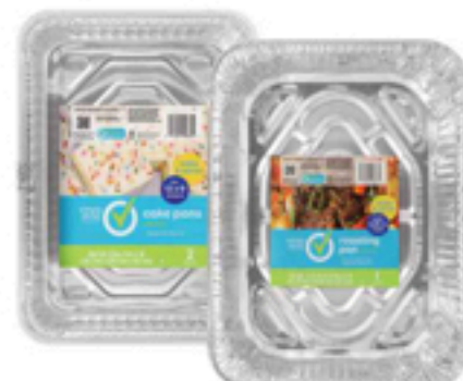
Simply Done Foil Pans Select Varieties 1-2 ct.