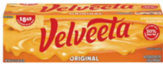
Velveeta Original p.p. $8.49, 32 oz.