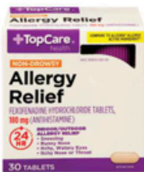
TopCare Allergy Relief fexofenadine 30 ct.