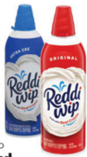
Reddi Wip Whipped Topping Select Varieties 6.5 oz. can