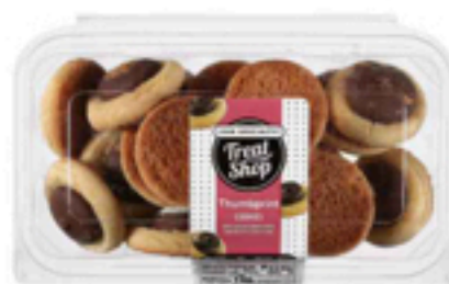
Our Specialty Treat Shop Thumbprint Cookies 10.5 oz.