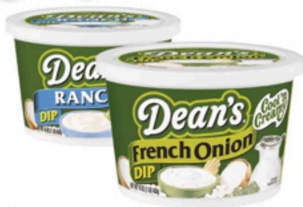
Dean's Dips Select Varieties 12-16 oz.