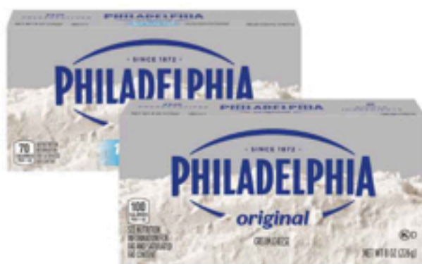
Philadelphia Cream Cheese regular or 1/3 less fat 8 oz.