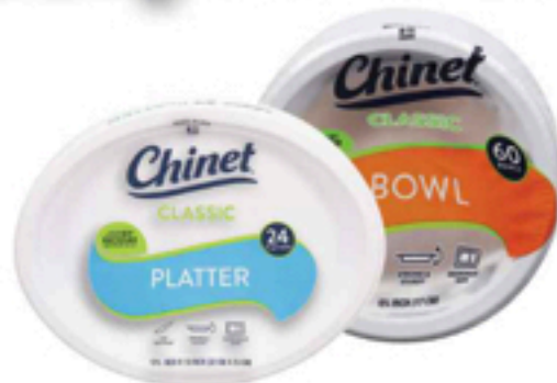
Chinet Paper Bowls or Plates Select Varieties 24-70 ct.