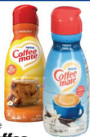
Coffee-Mate Liquid Coffee Creamer Select Varieties 28-32 oz.