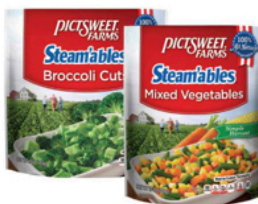
Pictsweet Steam'ables Select Varieties 10 oz.