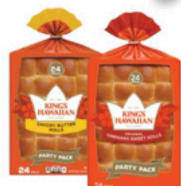
King's Hawaiian Rolls original or savory butter 24 ct.