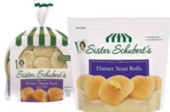
Sister Schubert's Dinner Rolls parker house style or yeast 10-13 oz.