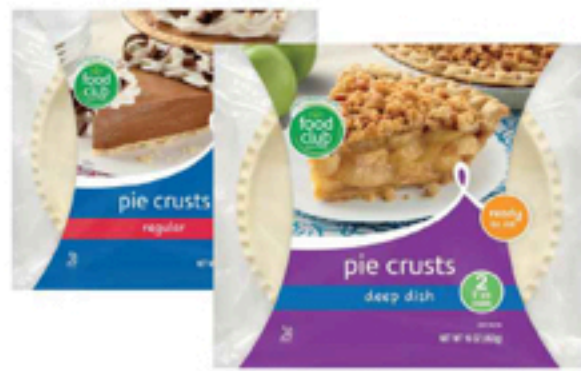
Food Club Pie Crusts regular or deep dish 2 ct.