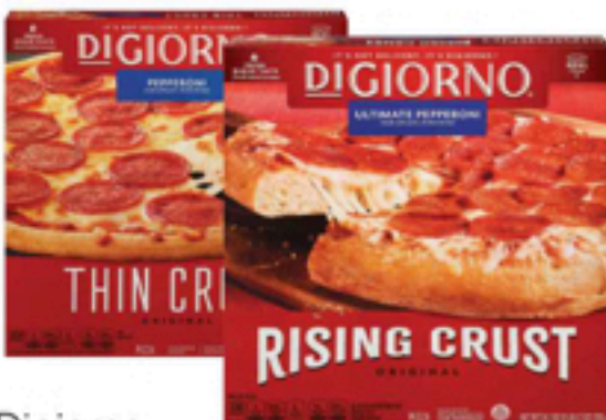
Digiorno Thin or Rising Crust Pizza Select Varieties 16.9-29.3 oz.