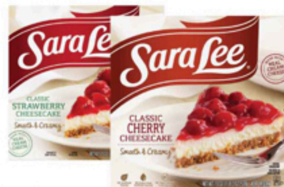
Sara Lee Cheesecake Classic, Cherry or Strawberry 17-19 oz.