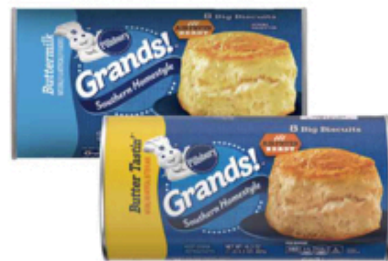
Pillsbury Grands! Biscuits Select Varieties 16.3 oz.