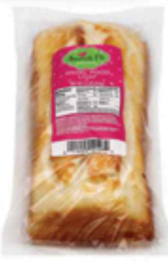
Sweet P's Angel Food Loaf 11 oz.