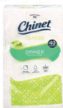
Chinet Classic Dinner Napkins 40 ct.