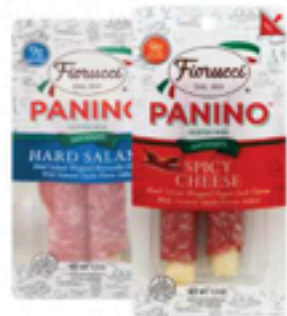
Fiorucci Panino Select Varieties 1.5 oz.