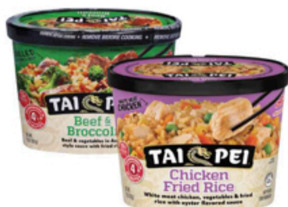
Tai Pei Asian Entrees Select Varieties 9-11 oz.