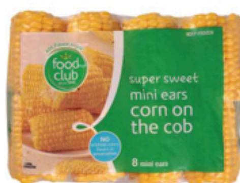
Food Club Corn on the Cob 8 ct. Mini Ears