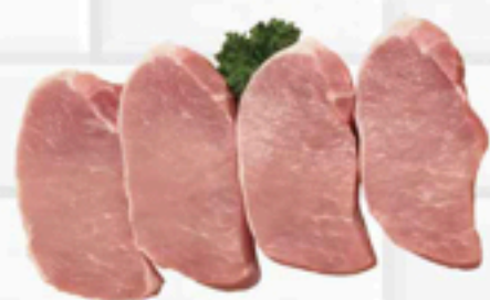
Center Cut Pork Loin Chops boneless, family pk. small pk...$3.19 lb.