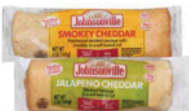
Johnsonville Cheddar Kolaches Smokey or Jalapeno 5 oz.