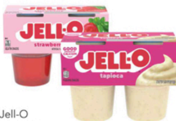
Jell-O Pudding or Gelatin Select Varieties 4 pk.