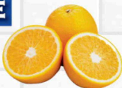
Juicy Oranges 3 lb. bag