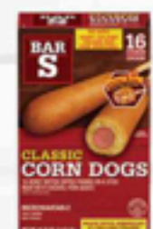
Bar S Classic Corn Dogs 2.67 lb. box