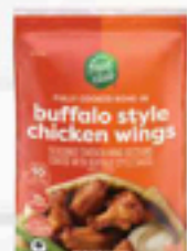
Food Club Breaded Buffalo Wings fully cooked 32 oz.