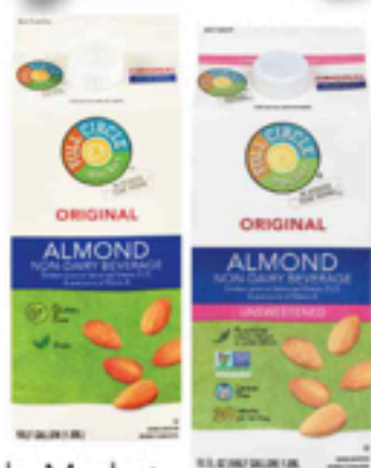
Full Circle Market Almondmilk Select Varieties 64 oz.