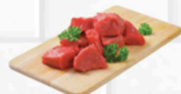
Beef Stew Meat boneless