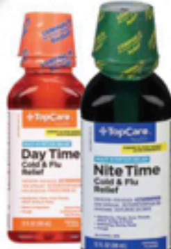
TopCare Cold & Flu Relief Day Time or Night Time 12 oz.