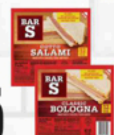
Bar S Cotto Salami or Meat Bologna classic or thick 12 oz.