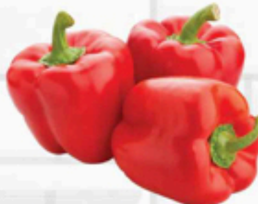
Large Red Bell Peppers