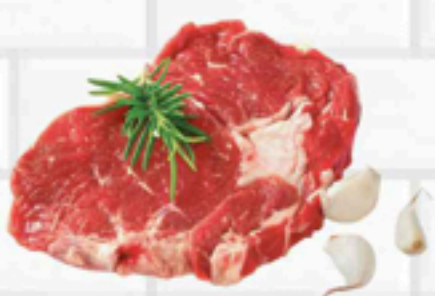
Choice Beef Chuck Steak boneless, family pk. single pk...$7.19 lb.