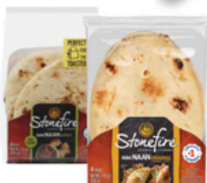
Stonefire Mini Naan Original or Garlic 4 pk.