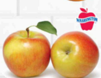
Large Fuji Apples