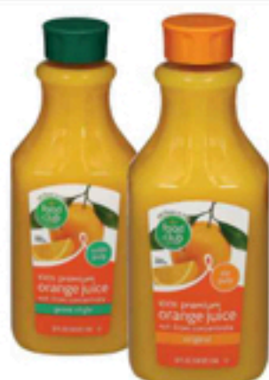
Food Club Orange Juice Select Varieties 52 oz.