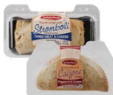
DePalo Foods Calzones or Strombolis Select Varieties 8 oz.