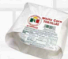
La Banderita Corn Tortillas paper wrapped 30 ct.