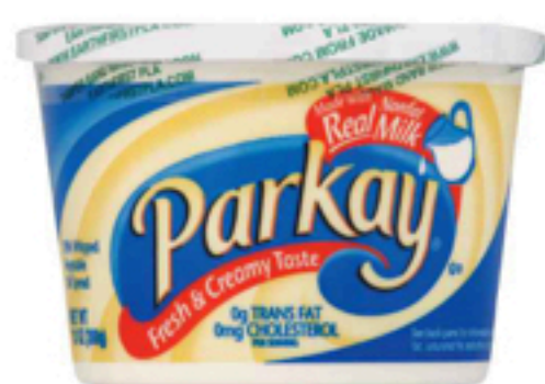
Parkay Soft Spread 13 oz.