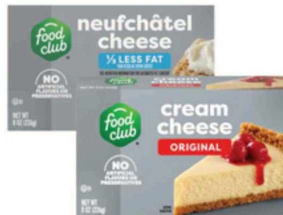
Food Club Cream Cheese original or 1/3 less fat 8 oz.