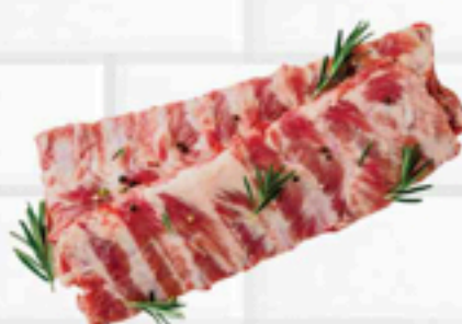
Pork Spareribs previously frozen