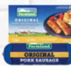
Farmland Pork Sausage Select Varieties links or rolls 8-12 oz.