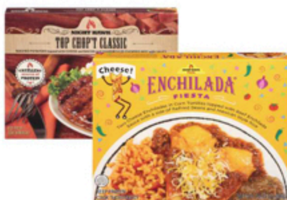
Night Hawk Dinners Select Varieties 6-11.1 oz.