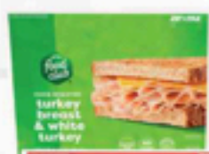
Food Club Ham or Turkey Select Varieties 16 oz.