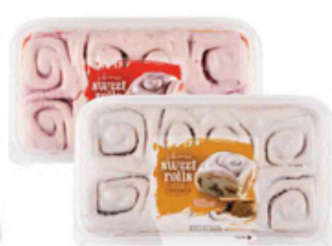
J. Skinner Iced Sweet Rolls Cinnamon or Strawberry 8 ct.