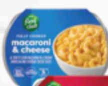
Food Club Mashed Potatoes or Macaroni & Cheese 20-24 oz.