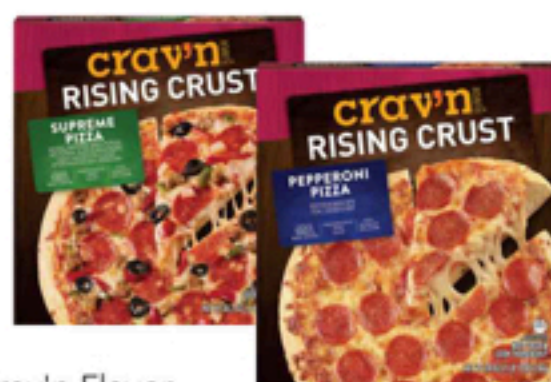
Crav'n Flavor Rising Crust Pizza Select Varieties 27-30.2 oz.