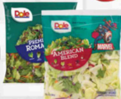
Dole Salad Mixes American Blend or Premium Romaine 9-12 oz.