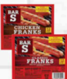
Bar S Chicken or Meat Franks classic or red 12 oz.