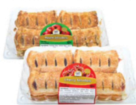
Del's Strudel Apple or Cherry 4 pk.