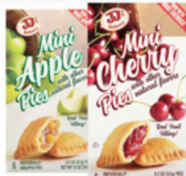
JJ's Bakery Mini Snack Pies Apple or Cherry 6 ct.