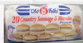
Purnell's Old Folks Country Sausage & Biscuits 20 ct.