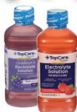
TopCare Electrolyte Solution Select Varieties 33.8 oz.