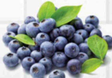
Blueberries 6 oz.