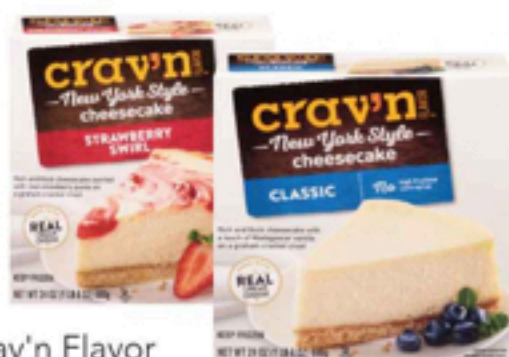
Crav'n Flavor New York Style Cheesecake Classic or Strawberry Swirl 24 oz.