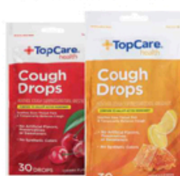
TopCare Cough Drops Select Varieties 25-30 ct.