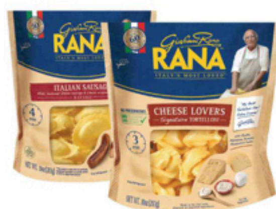
Rana Stuffed Pasta Select Varieties 10 oz.