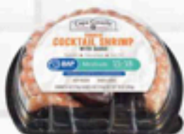
Cape Covelle Cocktail Shrimp with Sauce 10 oz.