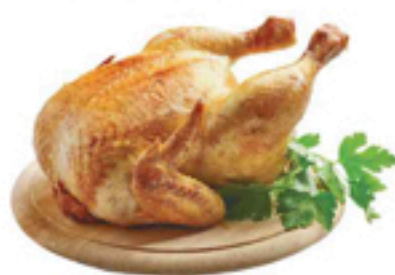
Smoked or Rotisserie Whole Chicken