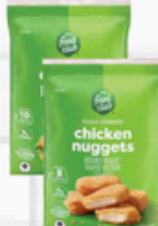
Food Club Breaded Chicken Patties or Nuggets fully cooked 32 oz.