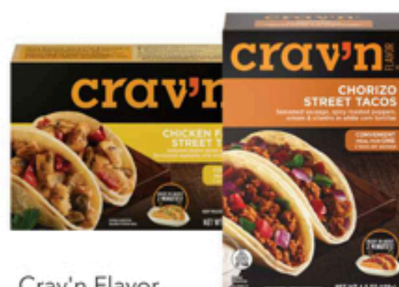
Crav'n Flavor Street Tacos chicken fajita or chorizo 4.5 oz.