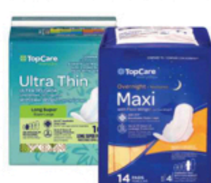
TopCare Pads or Liners Select Varieties 14-64 ct.