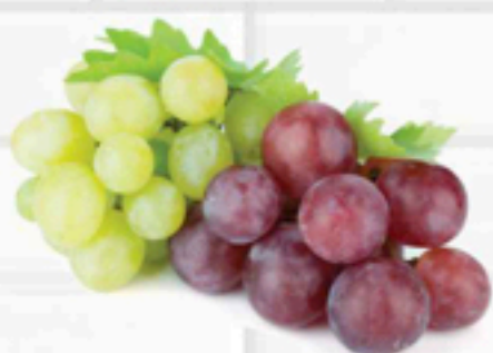
Extra Large Seedless Grapes red or green