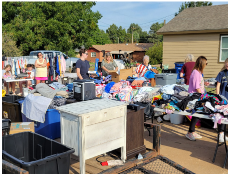
The 15th Annual Hennessey United Town-Wide Garage Sale turned quiet streets into bargain battlegrounds on Saturday