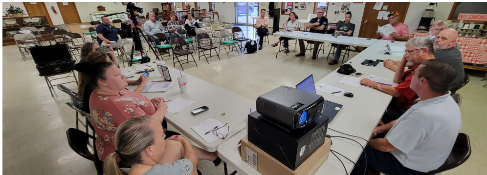
The Town Trustees met for a special meeting at the Senior Citizen Center, expecting a large crowd.

The Hennessey Board of Trustees held a special meeting on Wednesday, August 27th, to address ongoing problems with the town's new water meters. Expecting a large turnout, the meeting was moved to the Hennessey Senior Citizen Center, but only about a dozen residents attended.