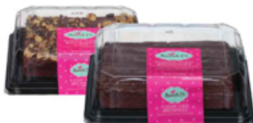
Sweet P's Iced Brownies Select Varieties 13 oz.