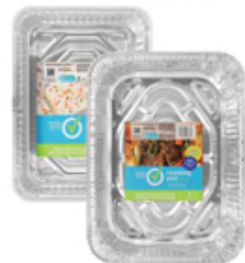
Simply Done Foil Pans Select Varieties 1-3 ct.