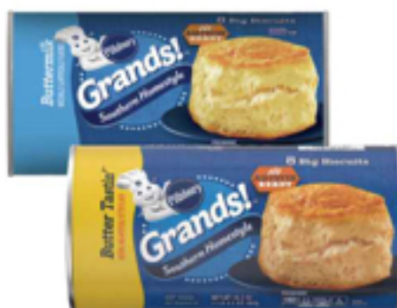
Pillsbury Grands! Biscuits Select Varieties 16.3 oz.