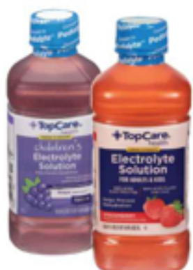
TopCare Electrolyte Solution Select Varieties 33.8 oz.