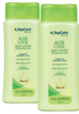
TopCare Body Lotion aloe cool 10 oz.