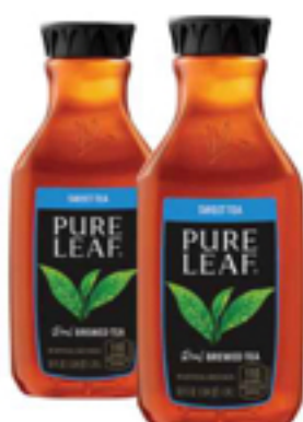
Pure Leaf Real Brewed Tea sweet or unsweetened 59 oz.