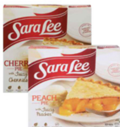
Sara Lee Fruit Pies Select Varieties 34 oz. 9 inch