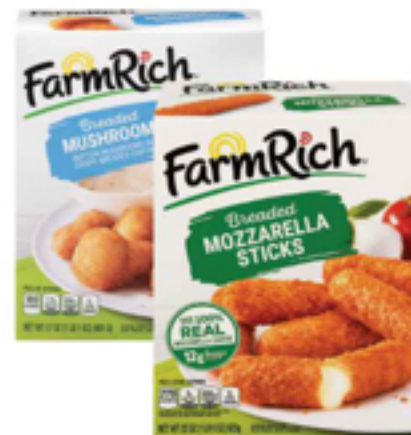
Farm Rich Appetizers Select Varieties 14.3-22 oz.