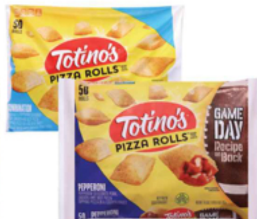
Totino's Pizza Rolls Select Varieties 50 ct.