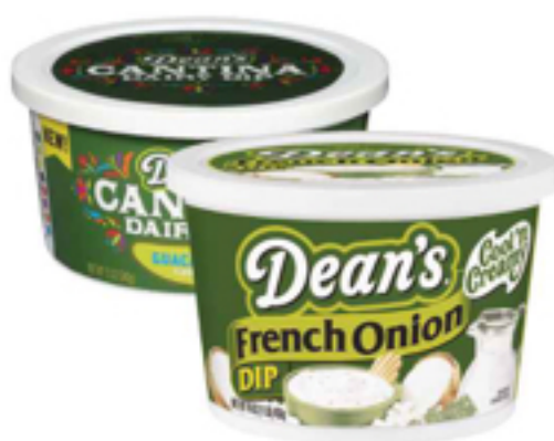
Dean's Dip Select Varieties 12-16 oz.