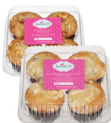
Sweet P's Muffins Select Varieties 4 ct.