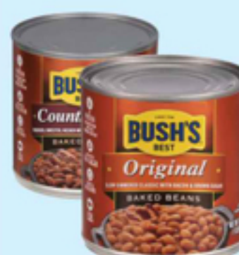
Bush's Best Baked Beans Select Varieties 15.8-16 oz.