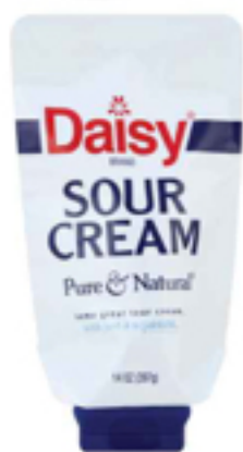
Daisy Sour Cream original or light 14 oz. squeeze