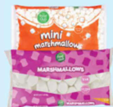
Food Club Marshmallows regular or mini 16 oz.

Look for this week's SMART BUY SPECIALS!