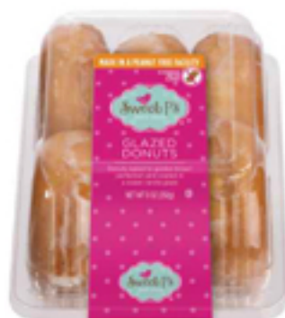
Sweet P's Glazed Donuts 6 ct.