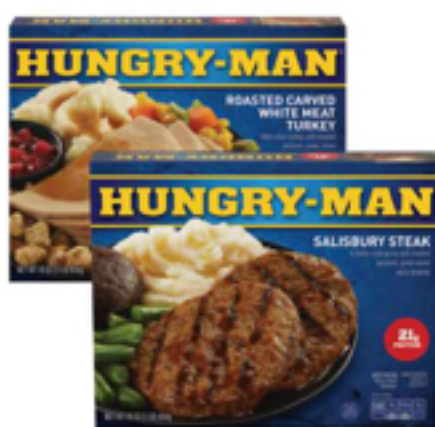
Hungry-Man Dinners Select Varieties 14.75-17 oz.