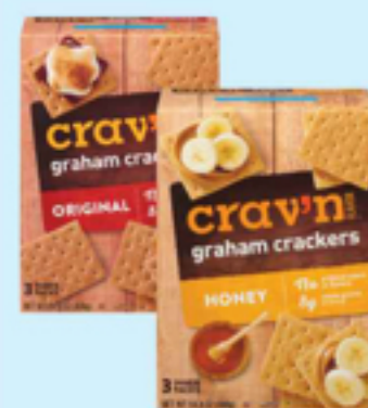
Crav'n Flavor Graham Crackers Select Varieties 14.4 oz.