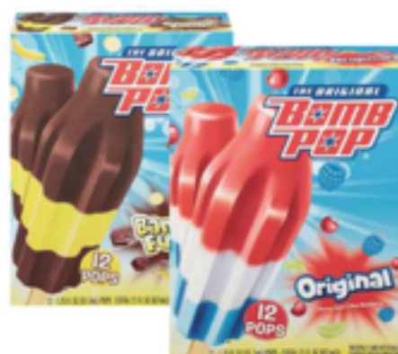
Bomb Pop Select Varieties 12 pk.