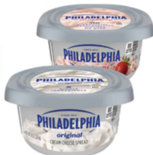
Philadelphia Cream Cheese Spread Select Varieties 7.5-8 oz.