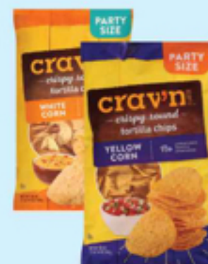
Crav'n Flavor Tortilla Chips Select Varieties 30 oz. party size