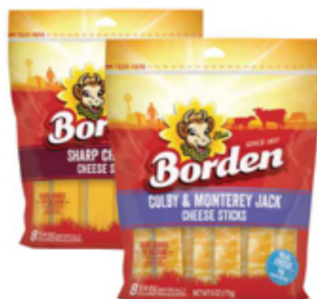
Borden Cheese Sticks Select Varieties 6 oz.