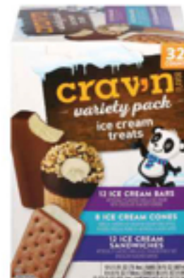
Crav'n Flavor Variety Pack Ice Cream Treats 32 ct.