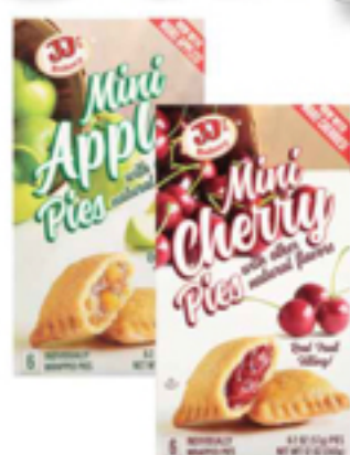
JJ's Bakery Mini Fried Pies apple or cherry 6 ct.