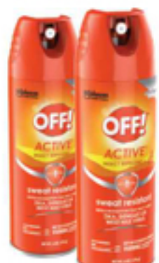
Off Insect Repellent active 6 oz.