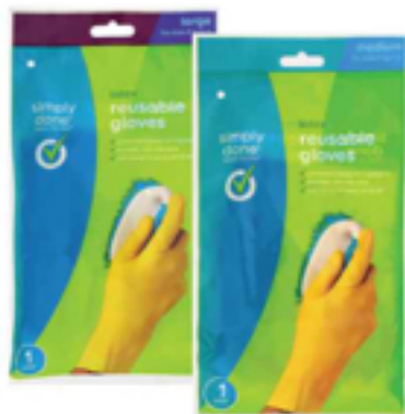
Simply Done Latex Reusable Gloves Select Varieties pair