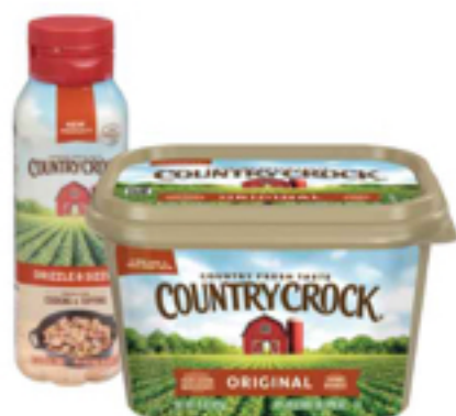
Country Crock Spread Select Varieties 14-15 oz.