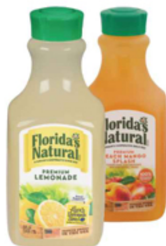
Florida's Natural Fruit Drinks Select Varieties 59 oz.