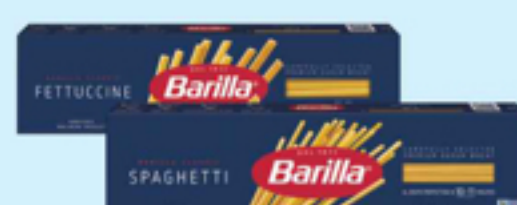
Barilla Pasta Select Varieties 12-16 oz.