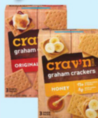
Crav'n Flavor Graham Crackers Select Varieties 14.4 oz.

Look for this week's SMART BUY SPECIALS!