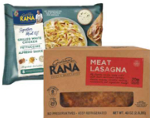
Rana Meal Kits or Entrees Select Varieties 32-40 oz.