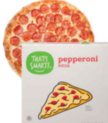
That's Smart! Pizza Sel. Varieties 5.2 oz.