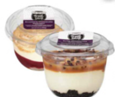
Our Specialty Treat Shop Parfaits Select Varieties 4.5 oz.