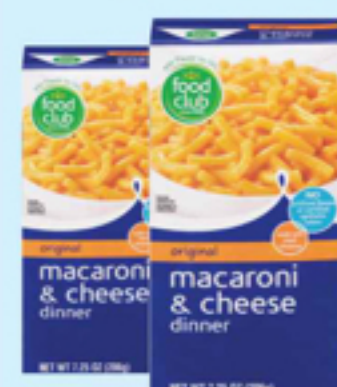
Food Club Macaroni & Cheese 7.25 oz.