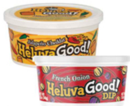
Heluva Good! Dips Select Varieties 12 oz.