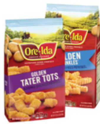
Ore-Ida French Fried Potatoes Sel. Varieties 26-32 oz.