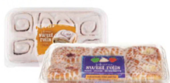
J. Skinner Cinnamon or Sweet Rolls Select Varieties 22 oz.