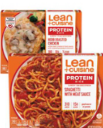
Lean Cuisine Dinners Sel. Varieties 6-11.5 oz.