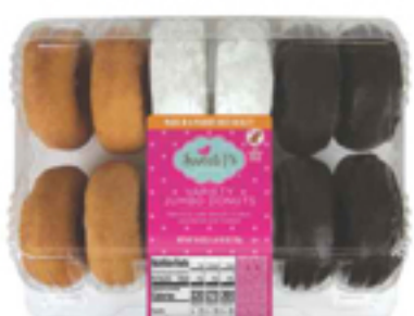
Sweet P's Variety Jumbo Donuts 12 ct.