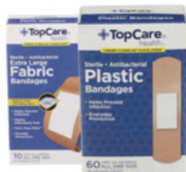
TopCare Bandages Select Varieties 10-60 ct.