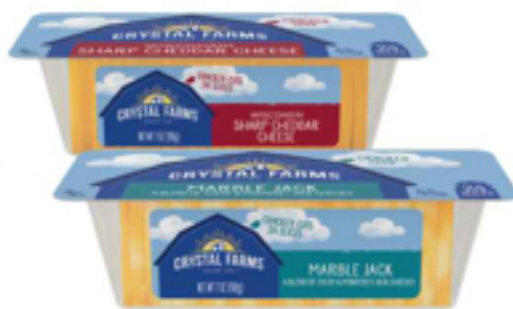
Crystal Farms Cracker Cuts Select Varieties 6-7 oz.