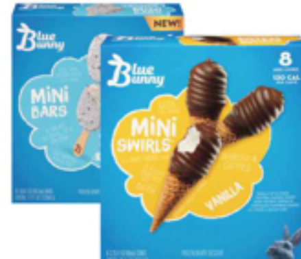
Blue Bunny Mini Bars or Bars Select Varieties 6-8 pk.