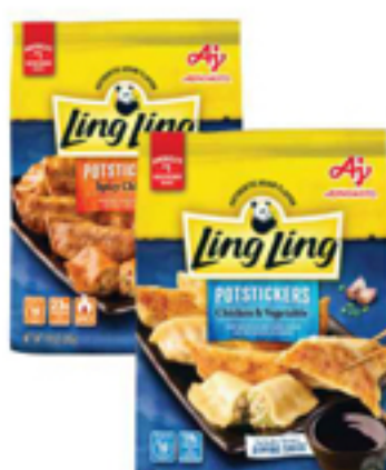
Ling Ling Potstickers Sel. Varieties 8.8-10.5 oz.