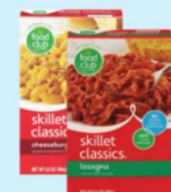
Food Club Skillet Classics Select Varieties 5.6-6.4 oz.