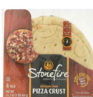
Stonefire Pizza Crust artisan thin 4 ct.