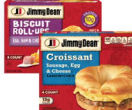
Jimmy Dean Breakfast Sandwiches or Roll-Ups Select Varieties 12.8-18 oz.