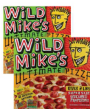
Wild Mike's Ultimate Pizza Sel. Varieties 40.25-42.43 oz.