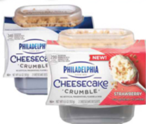
Philadelphia Cheesecake Crumble Select Varieties 2 ct.