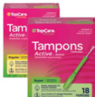
TopCare Tampons active regular or super 18 ct.