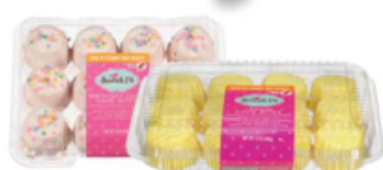
Sweet P's Cake Bites Select Varieties 12 ct.