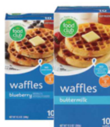
Food Club Waffles Select Varieties 10 ct.