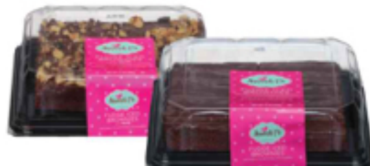
Sweet P's Iced Brownies Select Varieties 13 oz.