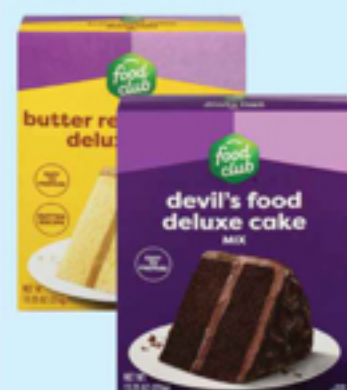
Food Club Cake Mix Select Varieties 13.25-14.25 oz.

Look for this week's SMART BUY SPECIALS!