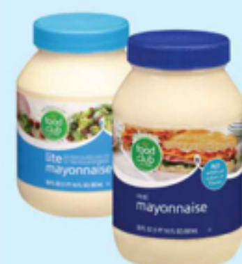
Food Club Mayonnaise real or lite 30 oz.