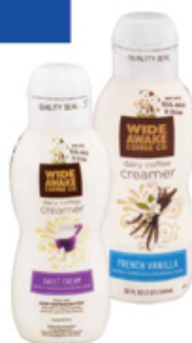
Wide Awake Coffee Co. Dairy Coffee Creamer Select Varieties 32 oz.