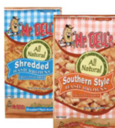
Mr. Dell's Hash Browns Select Varieties 24-32 oz.