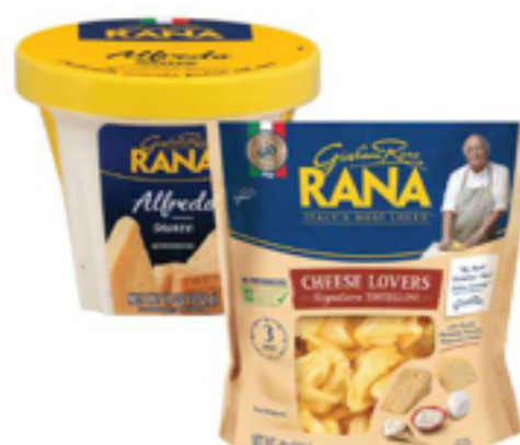
Rana Stuffed Pasta or Sauce Select Varieties 7-15 oz.