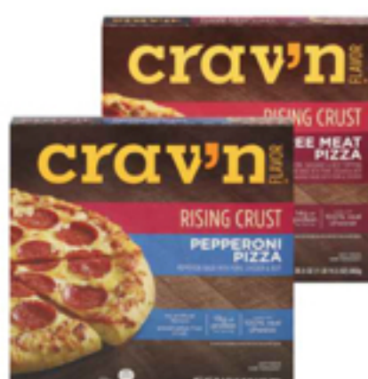
Crav'n Flavor Rising Crust Pizza Select Varieties 28.2-32.7 oz.