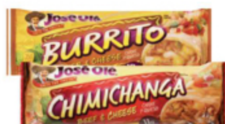
Jose Ole Chimichangas or Burritos Select Varieties 5 oz.