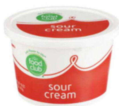
Food Club Sour Cream 16 oz.