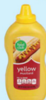
Food Club Yellow Mustard 20 oz.