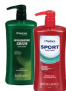
TopCare Body Wash sport or invigorating green 33.9 oz.