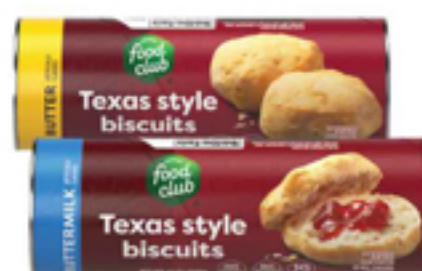
Food Club Texas Style Biscuits Select Varieties 10 ct.