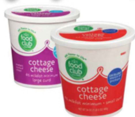
Food Club Cottage Cheese large or small curd 24 oz.