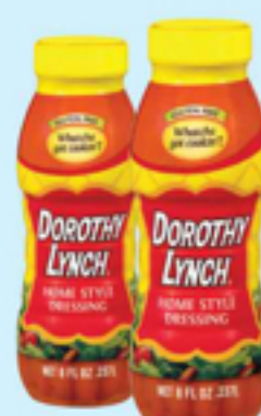
Dorothy Lynch Salad Dressing 8 oz.