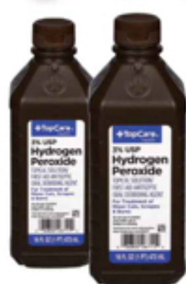
TopCare Hydrogen Peroxide 16 oz.