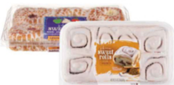
J. Skinner Cinnamon or Sweet Rolls Select Varieties 22 oz.