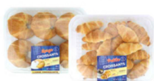
Cafe Valley Bakery Croissants petite or large 6-15 ct.