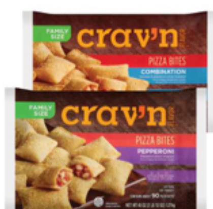
Crav'n Flavor Pizza Bites pepperoni or combination 90 ct.