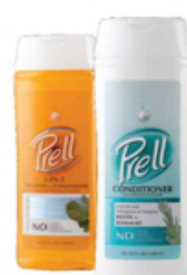
Prel Hair Products Select Varieties 12-13.5 oz.