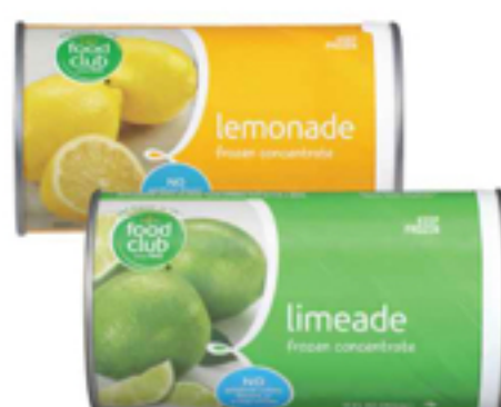
Food Club Fruit Drinks fruit punch, limeade or lemonade Select Varieties 12 oz.