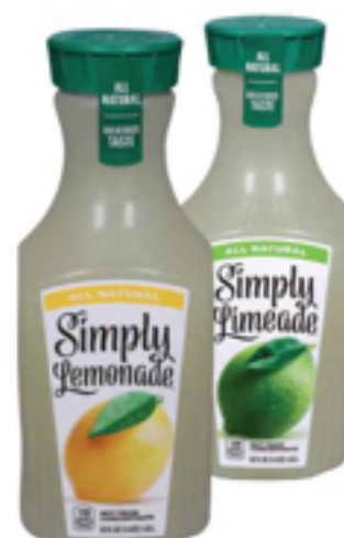
Simply Fruit Drinks Select Varieties 52 oz.