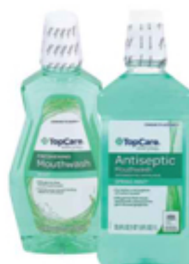
TopCare Mouthwash Select Varieties 33.8 oz.