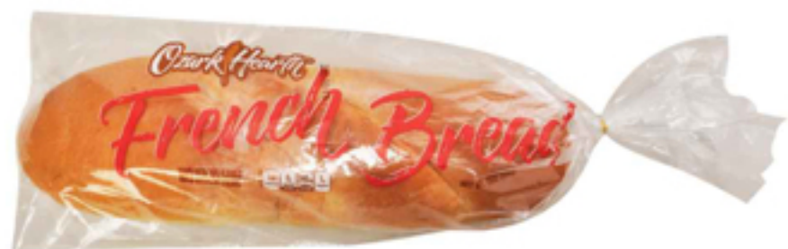
Ozark Hearth French Bread 16 oz.