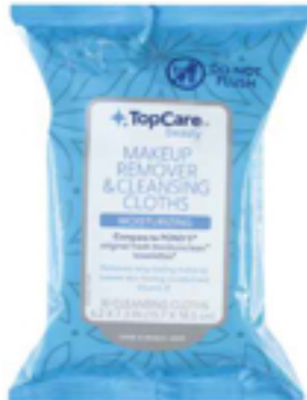
TopCare Makeup Remover & Cleansing Cloths Select Varieties 30 ct.