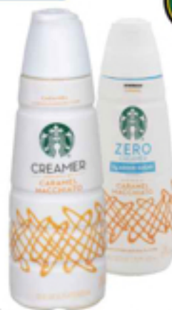
Starbucks Creamer Select Varieties 28 oz.