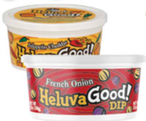
Heluva Good! Dips Select Varieties 12 oz.