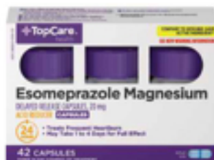
TopCare Esomeprazole Magnesium 42 ct.