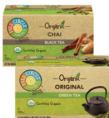
Full Circle Market Organic Tea Bags Select Varieties 20 ct.