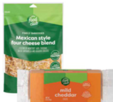
Food Club Shredded or Chunk Cheese Select Varieties 6-8 oz.