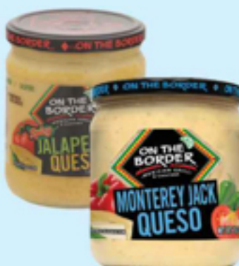
On The Border Queso Select Varieties 15.25-15.5 oz.