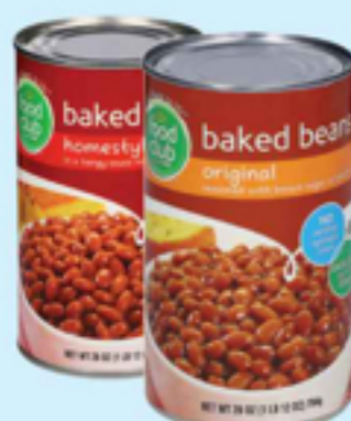
Food Club Baked Beans Select Varieties 28 oz.