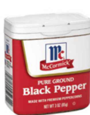
McCormick Black Pepper Pure Ground 3 oz.