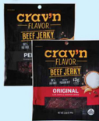
Crav'n Flavor Beef Jerky Select Varieties 2.2-2.85 oz.