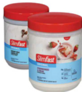
SlimFast Meal Replacement Shake Mix Select Varieties 12.83 oz.