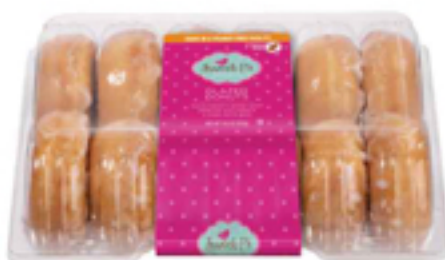
Sweet P's Glazed Donuts 12 ct.