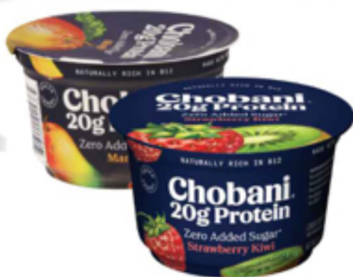
Chobani 20g Protein Yogurt Select Varieties 6.7 oz.