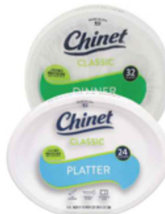
Chinet Classic Platters or Dinner Plates Select Varieties 24-32 ct.