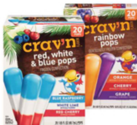
Crav'n Flavor Pops Select Varieties 20 pk.