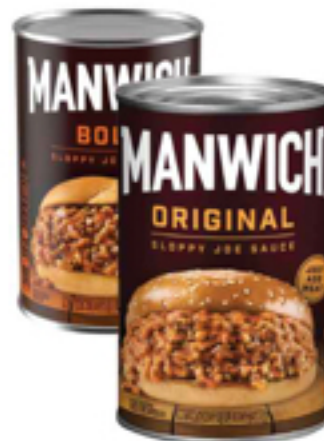
Manwich Sloppy Joe Sauce original or bold 24 oz.