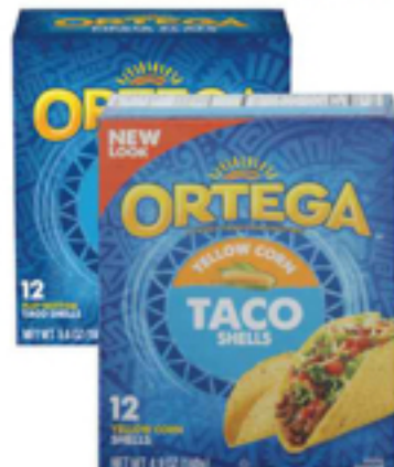
Ortega Taco Shells or Fiesta Flats 4.9-5.6 oz.