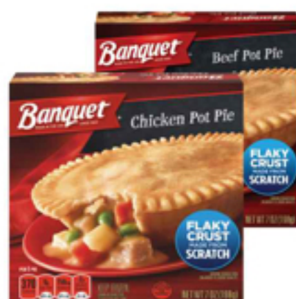
Banquet Pot Pies Select Varieties 7 oz.