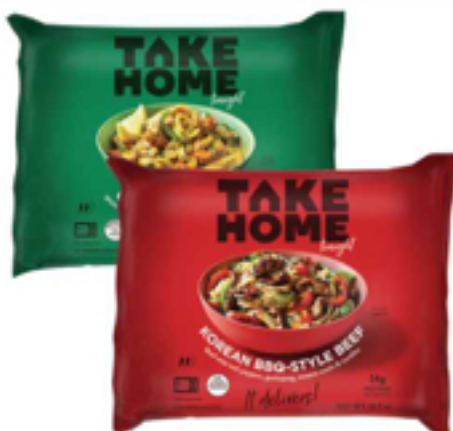
Take Home Tonight Meals Select Varieties 21.8-22.5 oz.