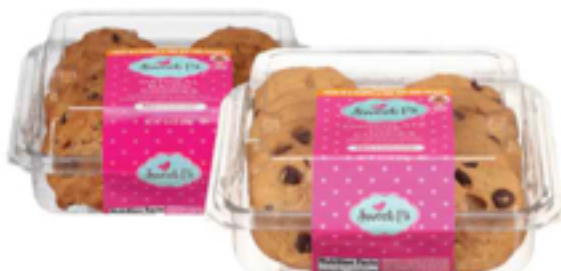
Sweet P's Cookies Select Varieties 10 ct.