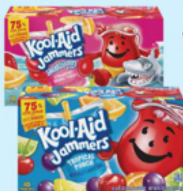
Kool-Aid Jammers Select Varieties 10 pk. 6 oz.