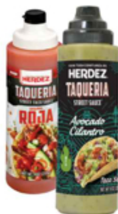
Herdez Taqueria Sauce Select Varieties 9 oz.