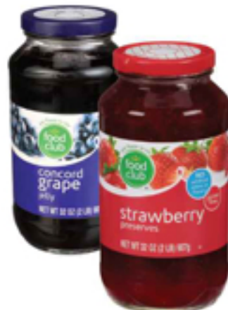
Food Club Strawberry Preserves or Concord Grape Jelly 32 oz.