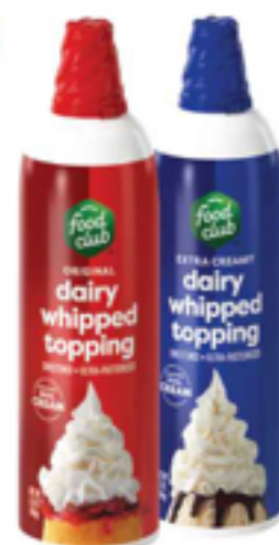
Food Club Dairy Whipped Topping original or extra creamy 6.5 oz.