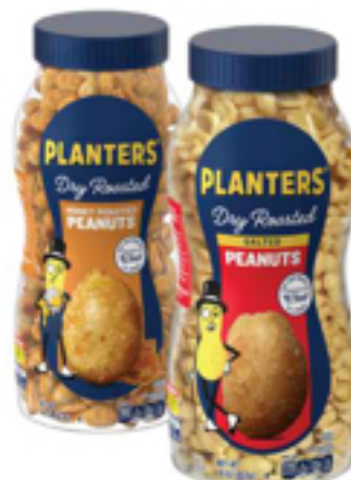
Planters Dry Roasted Peanuts Select Varieties 16 oz.