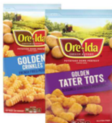
Ore-Ida Potatoes Select Varieties 19-32 oz.