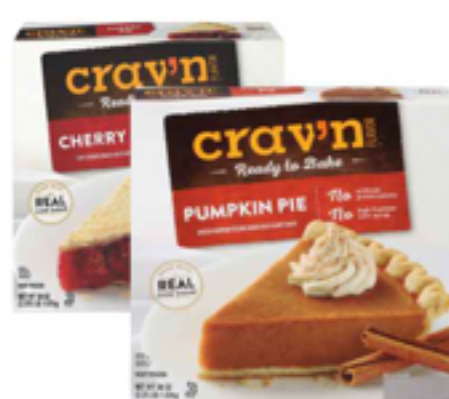
Crav'n Flavor Fruit Pies Select Varieties 36-38 oz.