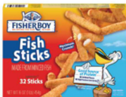
Fisher Boy Fish Sticks 32 ct.