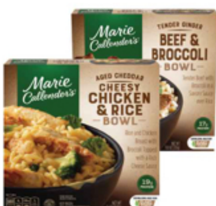
Marie Callender's Bowls Select Varieties 10.5-14.4 oz.