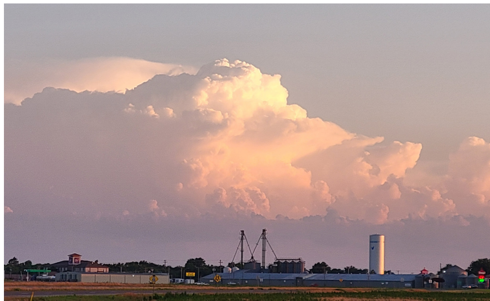
Storms building to the west of Hennessey at sunset.

Despite the warnings, Hennessey's sirens were not activated, as the most severe threats remained outside the town's immediate area. However, in Kingfisher, the situation was far more urgent. Radar showed a potential tornado inside city limits moving east along Highway 33. But when officials attempted to sound the sirens, they failed to activate. This critical failure that has prompted city leaders and county commissioners to consider upgrading to the same modern system Hennessey installed last year.