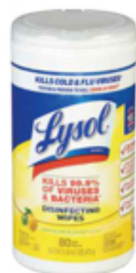
Lysol Wipes Lemon & Lime Blossom Scent 80 ct.

Look for this week's SMART BUY SPECIALS!