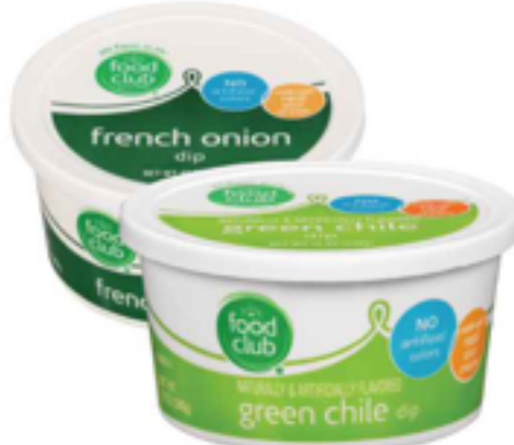
Food Club Dips Select Varieties 12 oz.