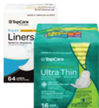
Topcare Pads or Liners Select Varieties 14-64 ct.