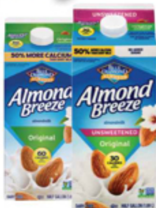
Almond Breeze Almondmilk Select Varieties 64 oz.