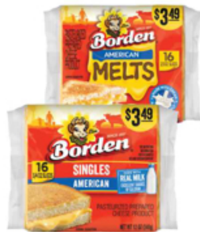
Borden Singles Select Varieties 10.67-12 oz. p.p. $3.49