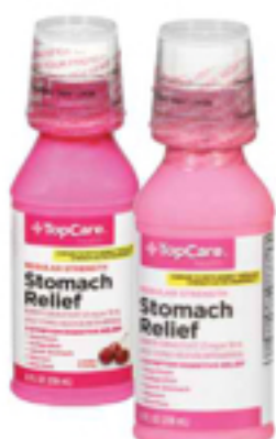
Topcare Stomach Relief original or cherry flavored 8 oz.