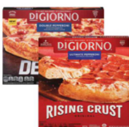
Digiorno Pizza Select Varieties 16.9-29.3 oz.