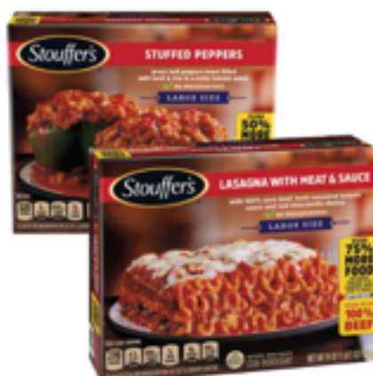
Stouffer's Dinners lasagne, mac & cheese or stuffed bell peppers 15.5-20 oz.