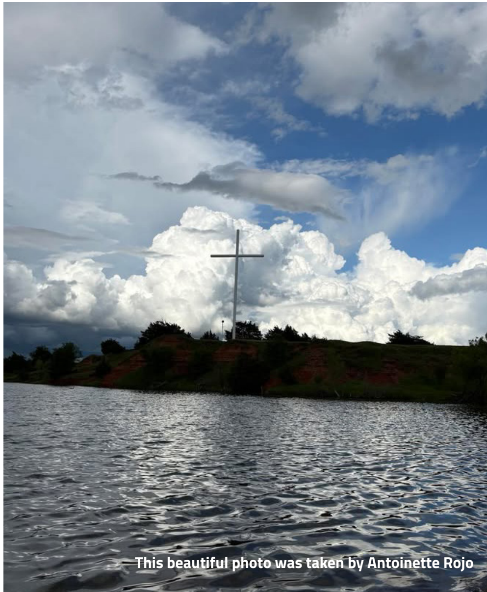
This beautiful photo was taken by Antoinette Rojo