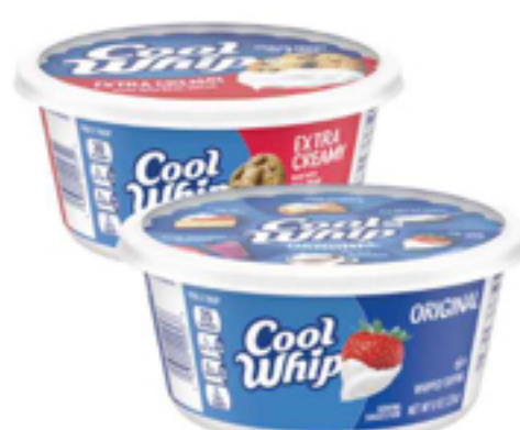
Cool Whip Whipped Topping Select Varieties 8 oz.