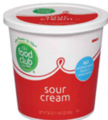
Food Club Sour Cream 24 oz.