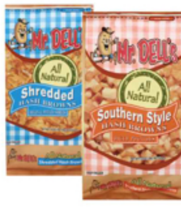
Mr Dell's Hash Browns Select Varieties 24-32 oz.