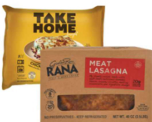
Rana Take Home Tonight Meals or Kits Select Varieties 32-40 oz.