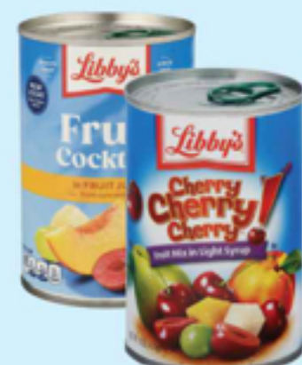
Libby's Fruit Cocktail Select Varieties 15-15.25 oz.