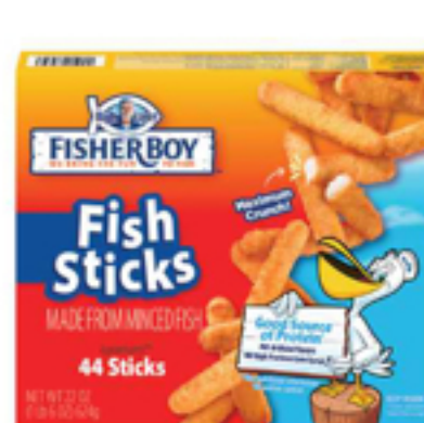
Fisher Boy Fish Sticks 44 ct.