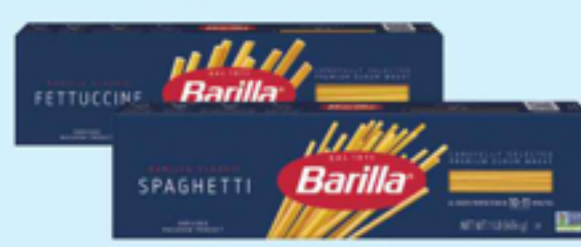
Barilla Pasta Select Varieties 12-16 oz.