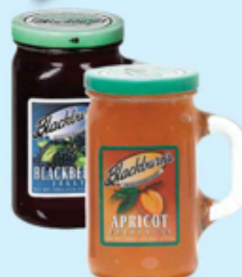
Blackburn's Preserves Select Varieties 18 oz.

Look for this week's SMART BUY SPECIALS!