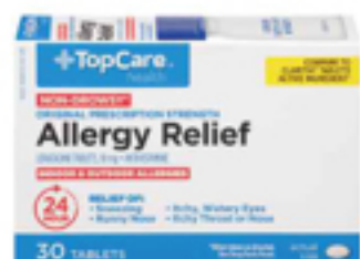
Topcare Allergy Relief loratadine 30 ct.