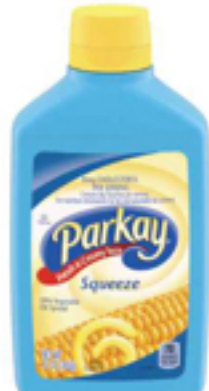
Parkay Spread 12 oz. squeeze