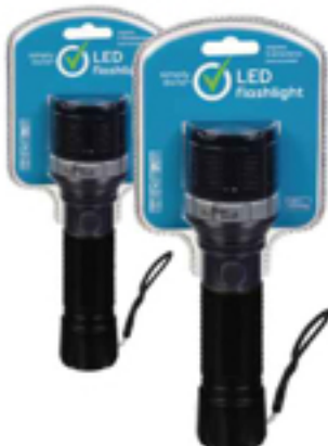
Simply Done LED Flashlight 1 ct.