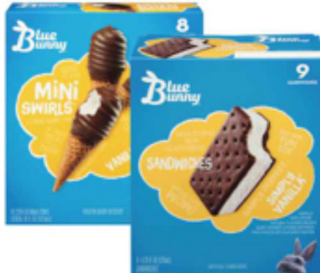
Blue Bunny Novelties Select Varieties 4-9 ct.