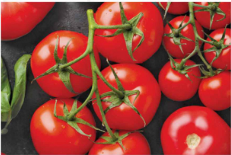
Red Ripe Tomatoes