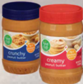
Food Club Peanut Butter creamy or crunchy 16 oz.