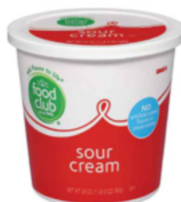
Food Club Sour Cream 24 oz.