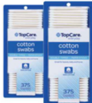
TopCare Cotton Swabs 375 ct.