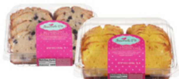
Sweet P's Sliced Crème Cake Select Varieties 16 oz.