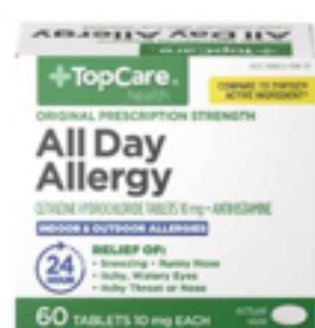
TopCare All Day Allergy cetirizine hydrochloride 60 ct. tablets