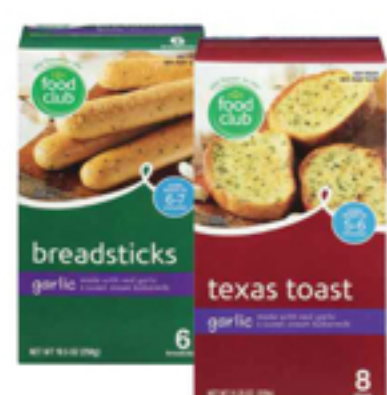
Food Club Garlic Texas Toast or Breadsticks Select Varieties 10.5-11.3 oz.