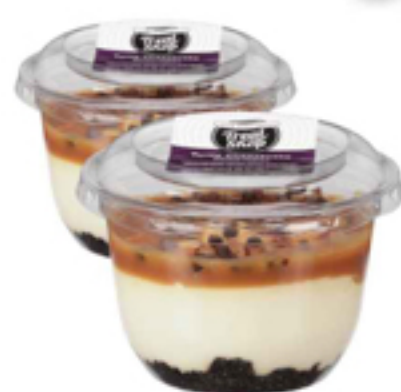
Our Specialty Treat Shop Parfait Select Varieties 4.5 oz.