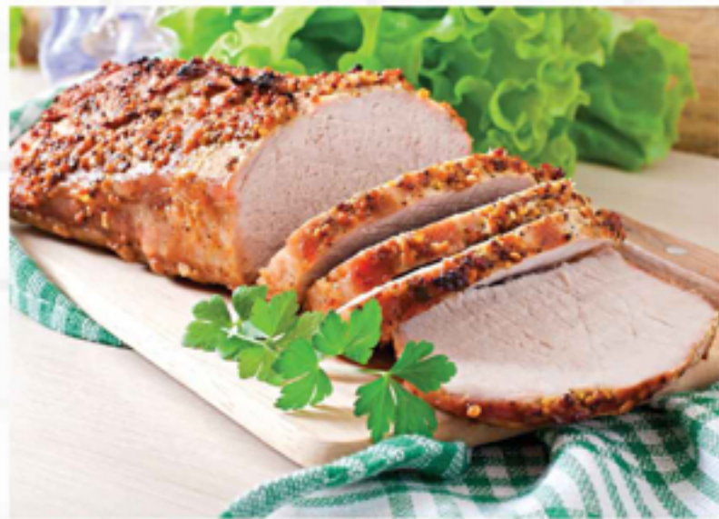
Boneless Pork Loins previously frozen