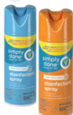
Simply Done Disinfectant Spray Select Varieties 12.5 oz.