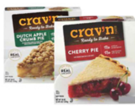
Crav'n Flavor Fruit Pies Select Varieties 38 oz.