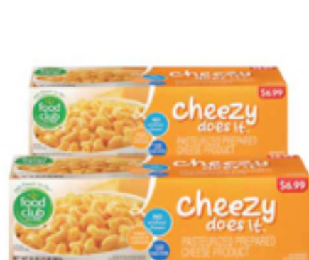
Food Club Cheezy Does It p.p. $6.99 32 oz.