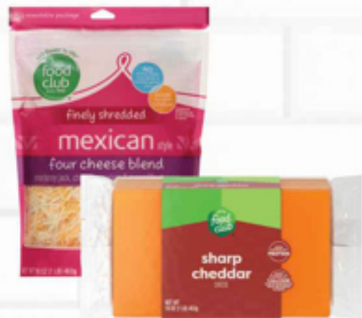
Food Club Shredded or Chunk Cheese Select Varieties 16 oz.