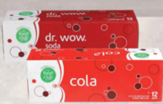
Food Club Soda Select Varieties 12 pk. 12 oz. cans