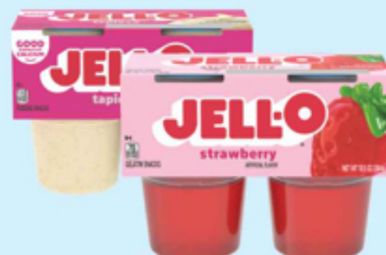
Jell-O Pudding, Gels or Cheesecake Snacks Select Varieties 4 pk.

Look for this week's SMART BUY SPECIALS!