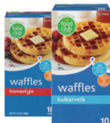
Food Club Waffles Select Varieties 10 ct.