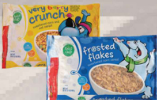
Food Club Cereal Select Varieties 28-32 oz. bag