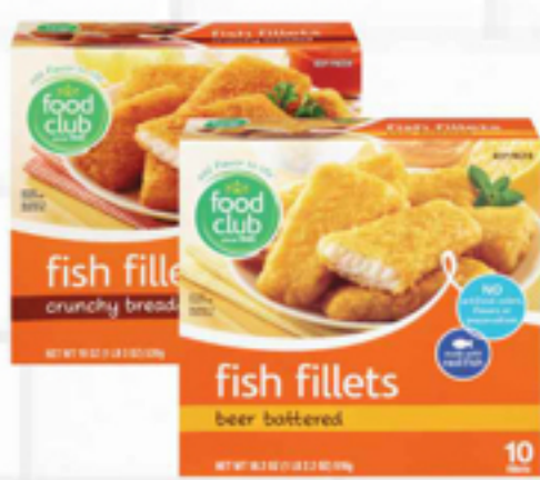
Food Club Fish Fillets Select Varieties 18.2-19.2 oz.