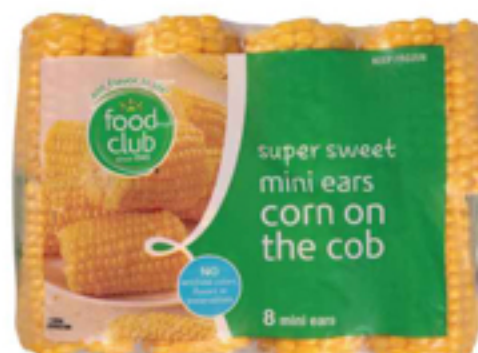
Food Club Corn on the Cob 8 mini ears super sweet