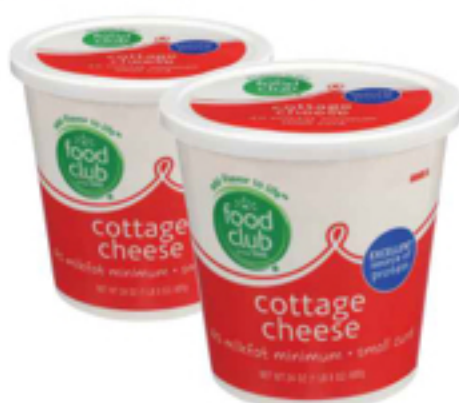
Food Club Cottage Cheese large or small curd 24 oz.