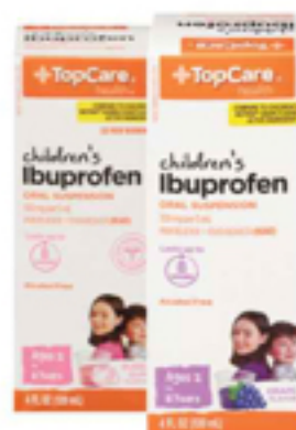
TopCare Children's Ibuprofen Select Varieties 4 oz.