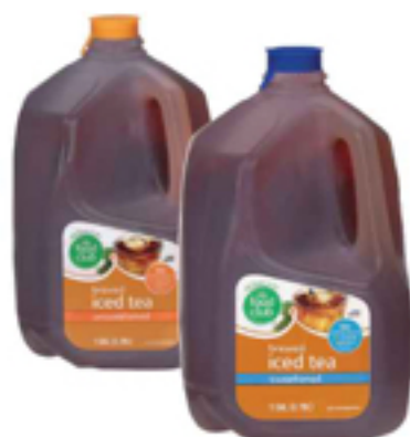
Food Club Iced Tea sweetened or unsweetened 128 oz.