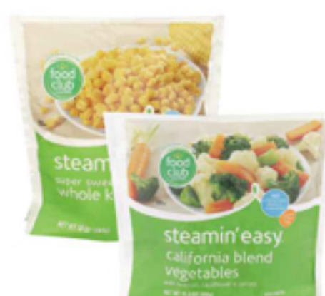
Food Club Steamin' Easy Vegetables Select Varieties 10-10.8 oz.