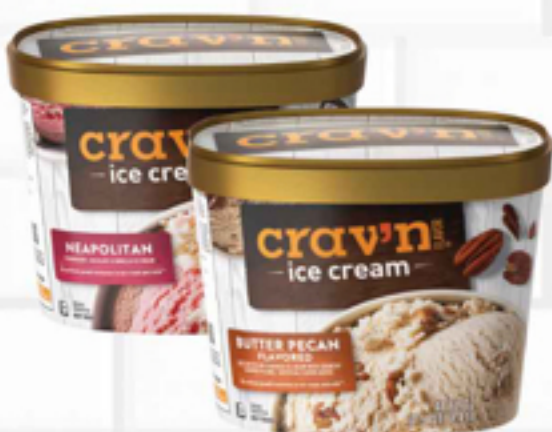
Crav'n Flavor Ice Cream Select Varieties 48 oz.