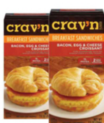
Crav'n Flavor Breakfast Sandwiches Select Varieties 2 ct.