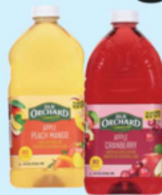
Old Orchard Cocktails Select Varieties 64 oz.