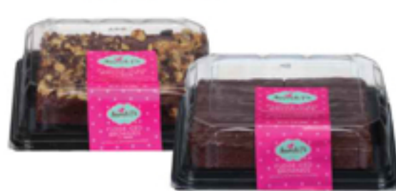
Sweet P's Iced Brownies Select Varieties 13 oz.