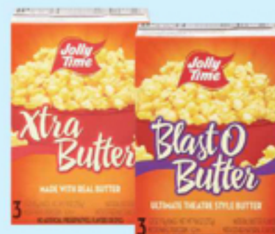
Jolly Time Popcorn Select Varieties 3 ct.