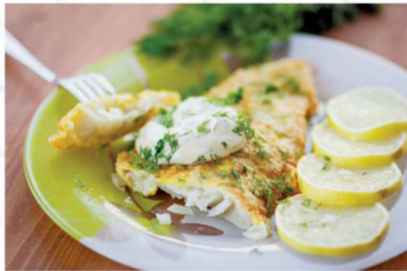
Farm Raised Tilapia Fillets