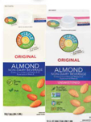
Full Circle Market Almondmilk Select Varieties 64 oz.