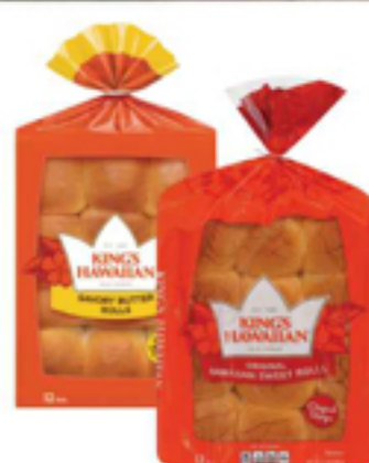
King's Hawaiian Rolls Select Varieties 12 ct.