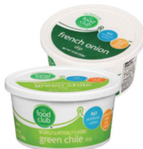
Food Club Dips Select Varieties 12 oz.