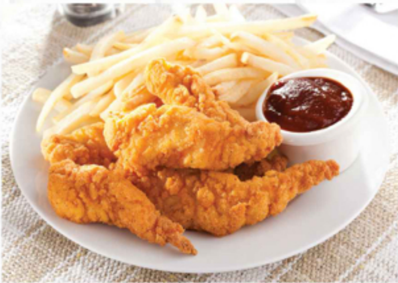
Boneless Breast Tenders previously frozen