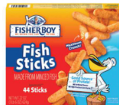
Fisher Boy Fish Sticks 44 sticks