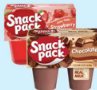
Hunt's Snack Pack Pudding or Gels Select Varieties 4 pack

Look for this week's SMART BUY SPECIALS!