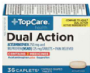
Topcare Dual Action Pain Relief Acetaminophen/Ibuprofen 36 caplets