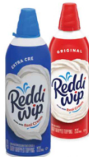
Reddi Wip Whipped Topping Select Varieties 6.5 oz.