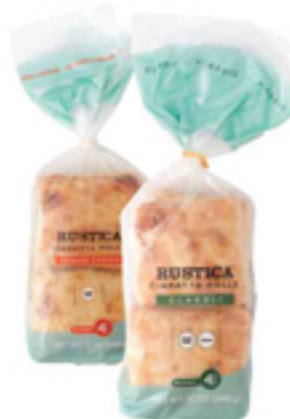
Rustica Ciabatta Rolls Classic or Asiago Cheese 12 oz.