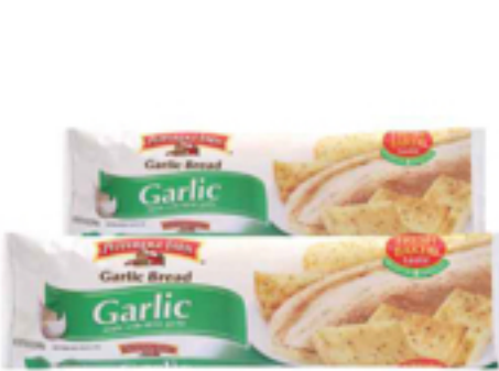
Pepperidge Farm Garlic Bread 10 oz.