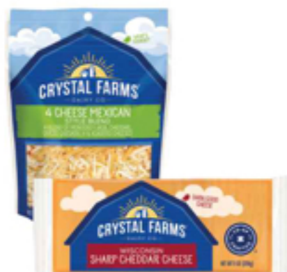
Crystal Farms Shredded or Chunk Cheese Select Varieties 5.5-8 oz.