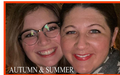
AUTUMN & SUMMER