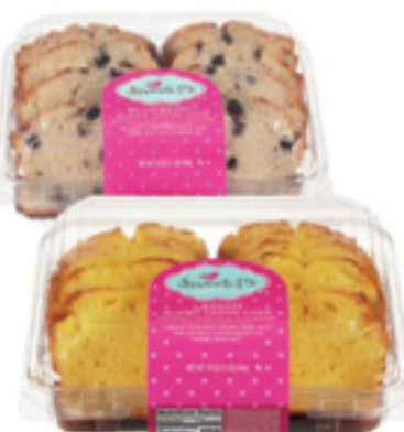
Sweet P's Loaf Cakes Select Varieties 16 oz.