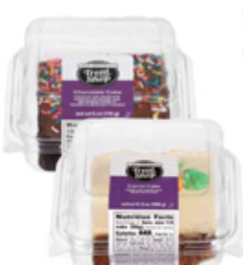
Our Specialty Treat Shop Cake Squares Select Varieties 5.8-6.5 oz.