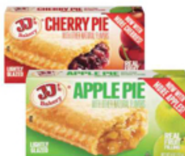
JJ's Bakery Fried Pies Select Varieties 4 oz.