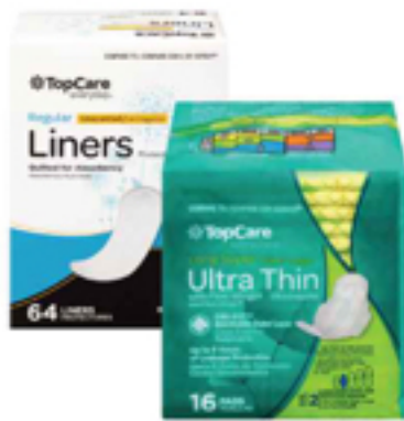
Topcare Pads or Liners Select Varieties 14-64 ct.