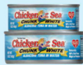
Chicken Of The Sea Chunk Light Tuna in water 5 oz.