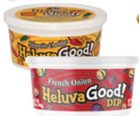
Heluva Good! Dips Select Varieties 12 oz.