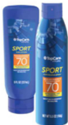
Topcare Sunscreen Select Varieties 3-8 oz.