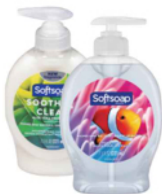
Softsoap Liquid Hand Soap Select Varieties 7.5 oz.