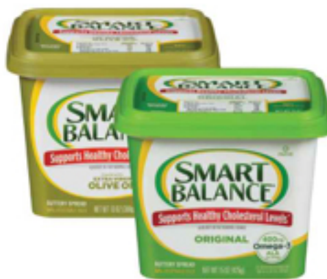
Smart Balance Buttery Spread Select Varieties 13-15 oz.