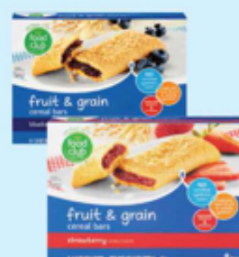
Food Club Fruit & Grain Cereal Bars Select Varieties 8 ct.