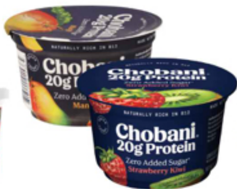
Chobani 20g Protein Greek Yogurt Select Varieties 6.7 oz.