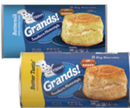
Pillsbury Grands! Biscuits Select Varieties 16.3 oz.