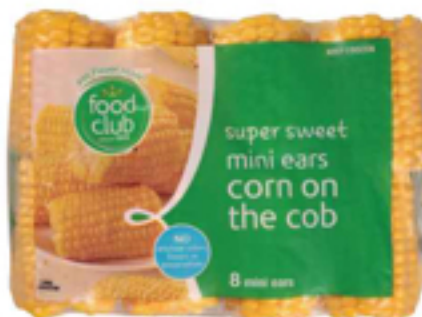
Food Club Mini Corn on the Cob 8 ct.