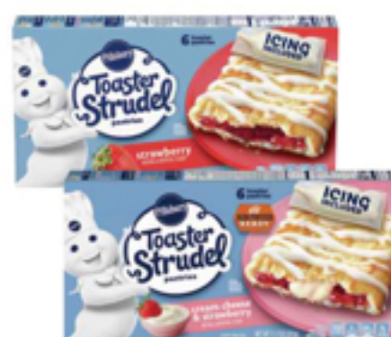
Pillsbury Toaster Strudel Select Varieties 6 ct.