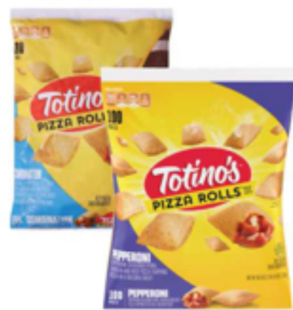
Totino's Pizza Rolls Select Varieties 100 ct.