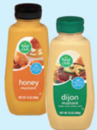
Food Club Deli Mustard Select Varieties 12 oz.