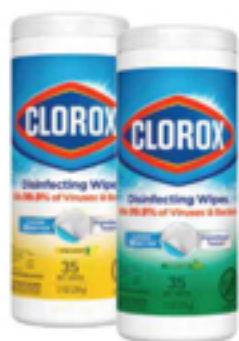
Clorox Disinfecting Wipes Fresh or Lemon Scent 35 ct.