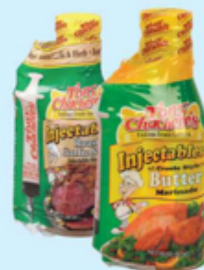
Tony Chachere's Injectables Select Varieties 17 oz.