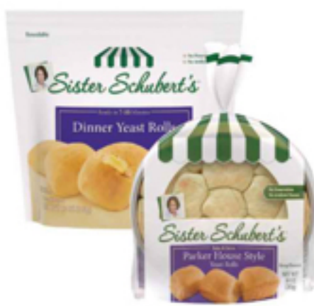
Sister Schubert's Rolls Parker House or Yeast 10 ct.