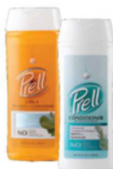
Prel Hair Products Select Varieties 12-13.5 oz.