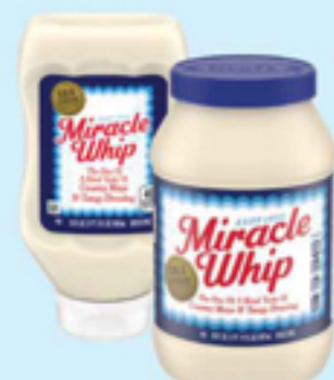
Kraft Miracle Whip Select Varieties 19-30 oz.