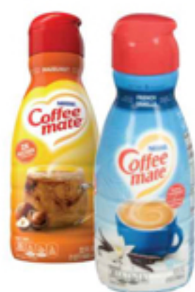
Coffee-Mate Liquid Coffee Creamer Select Varieties 32 oz.