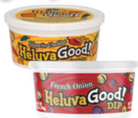
Heluva Good! Dips Select Varieties 12 oz.