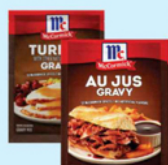
McCormick Gravy Mix Select Varieties .75-1 oz.