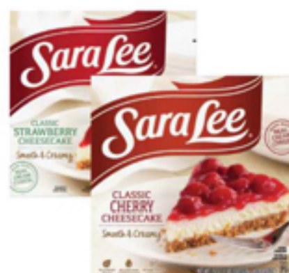
Sara Lee Cheesecake Select Varieties 17-19 oz.