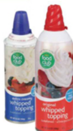
Food Club Whipped Topping Original or Extra Creamy 6.5 oz.