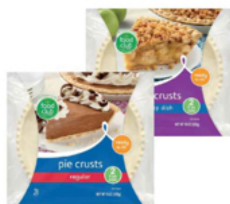
Food Club Pie Shells Regular or Deep Dish 15-16 oz., 2 pack