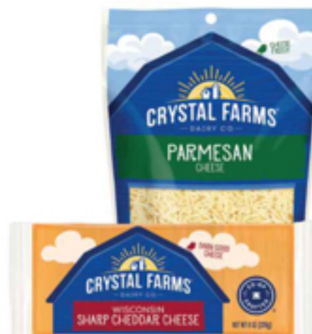
Crystal Farms Shredded or Chunk Cheese Select Varieties 5.5-8 oz.