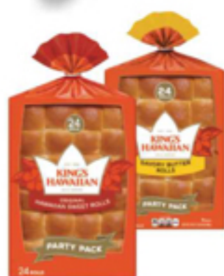
King's Hawaiian Round Hawaiian Sweet Bread 16 oz.