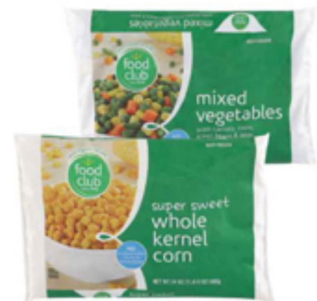
Food Club Vegetables Select Varieties 24 oz.