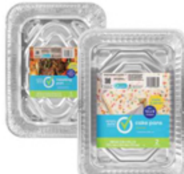
Simply Done Foil Pans Select Varieties 1-3 ct.