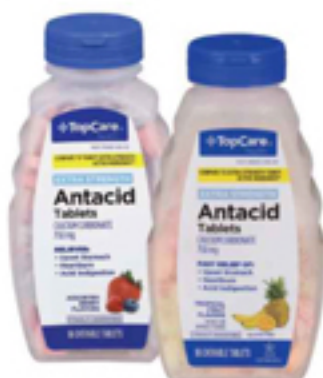
TopCare Extra Strength Antacid Tablets Select Varieties 96 ct.