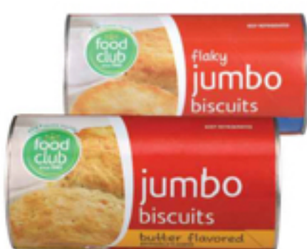
Food Club Jumbo Biscuits Select Varieties 8 ct.