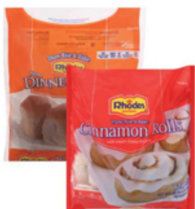
Rhodes Rolls Dinner or Cinnamon 12-36 ct.