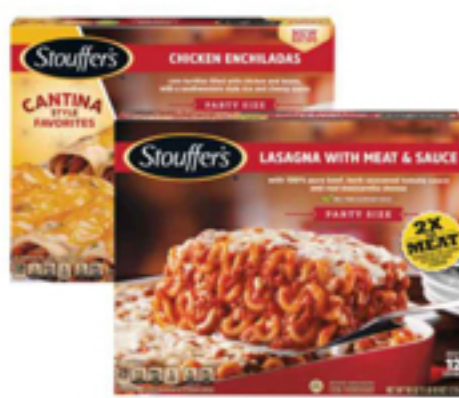
Stouffer's Lasagna or Chicken Enchiladas 57-90 oz. Party Size