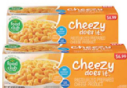
Food Club Cheezy Does It 32 oz.