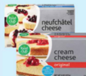
Food Club Cream Cheese Regular or 1/3 Less Fat 8 oz.

Look for this week's SMART BUY SPECIALS!