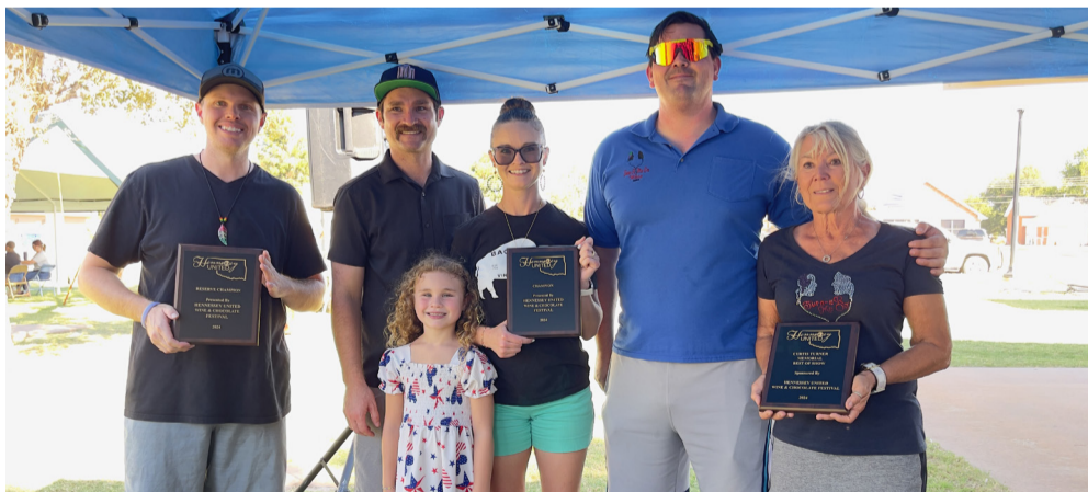
Pictured left to right 3rd place Wild Horse Canyon Farms, 2nd place Backyard Winery and 1st place Turn-eR Me On Winery.