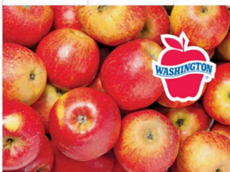
Red Delicious, Fuji or Gala Apples 3 lb. bag