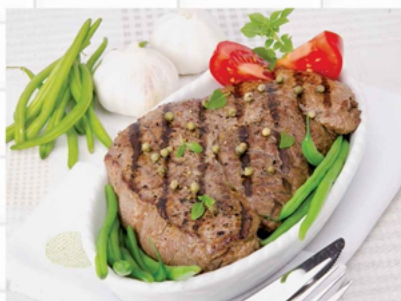
Boneless Beef Top Sirloin Steak

Preferred Trim, Family Pack Single Pack... $6.19 lb.