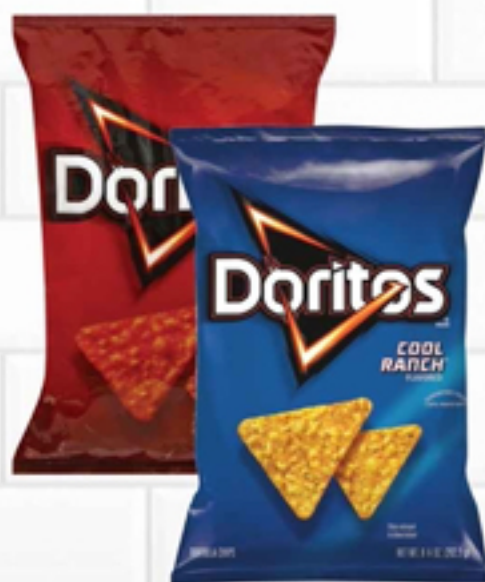
Doritos Tortilla Chips Select Varieties p.p. $6.29