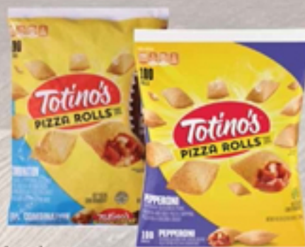
Totino's Pizza Rolls Select Varieties 100 ct.