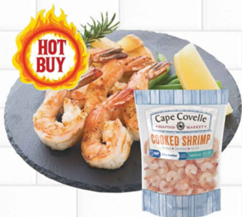
Cape Covelle Cooked Shrimp 41/50 ct., p&d, Tail on, 1 lb. pkg.