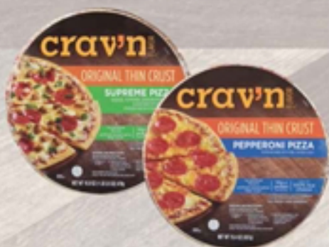
Crav'N Flavor Original Thin Crust Pizza Select Varieties 14.5-16.9 oz.