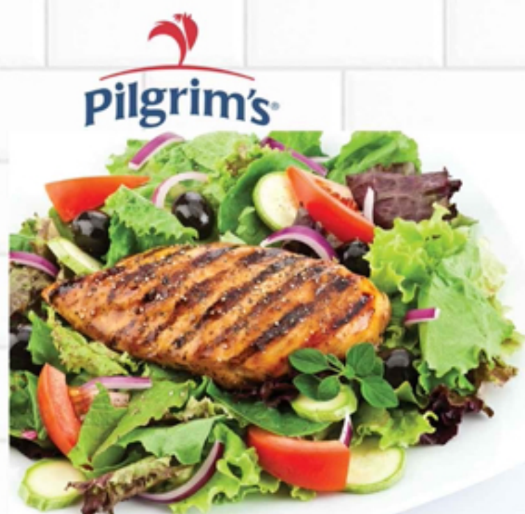
Pilgrim's Boneless Skinless Chicken Breast