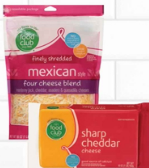
Food Club Shredded or Chunk Cheese Select Varieties 16 oz.