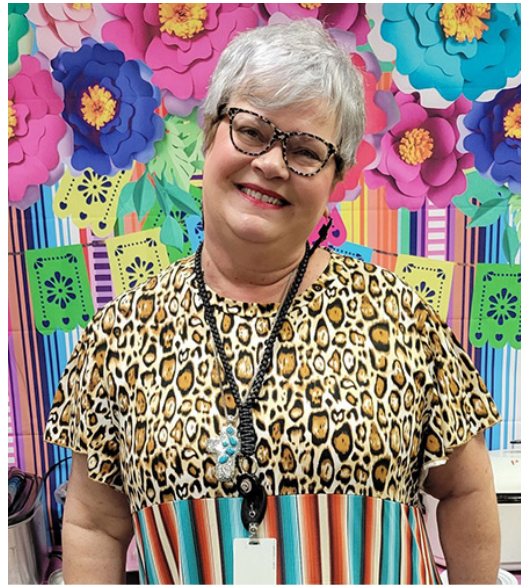
Transitions by Bonny Flesher