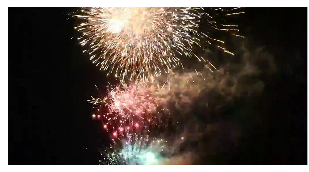
4TH OF JULY FIREWORKS HENNESSEY STYLE