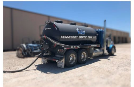
Trust our experienced team to keep your septic system running smoothly Contact us today for all your septic system needs.