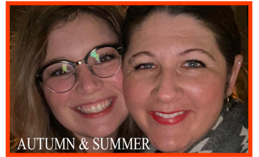
AUTUMN & SUMMER