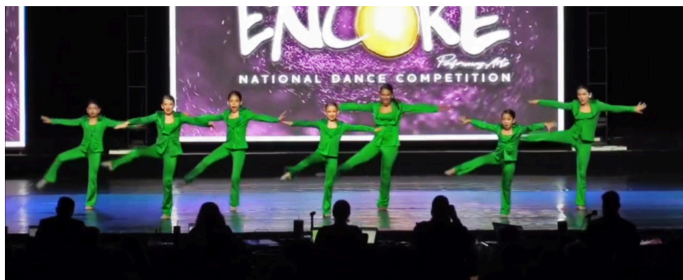
RedLeve performs its jazz routine at encore dance nationals.