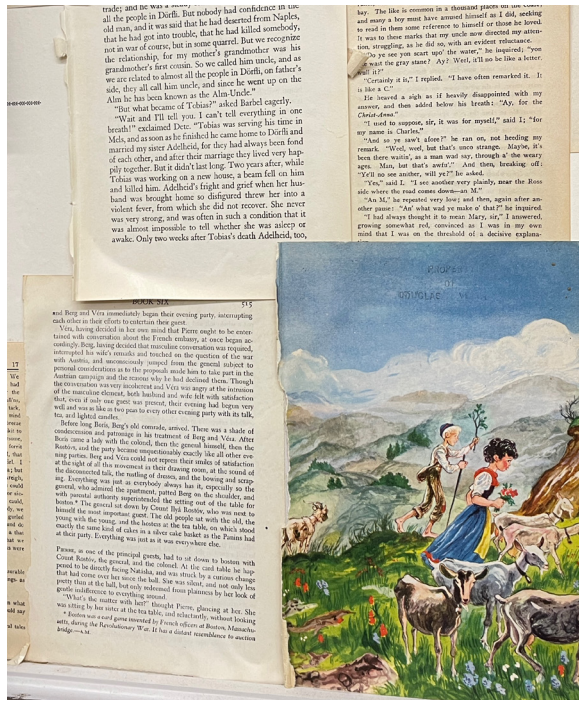
Book pages that line the walls at Prairie Quilt