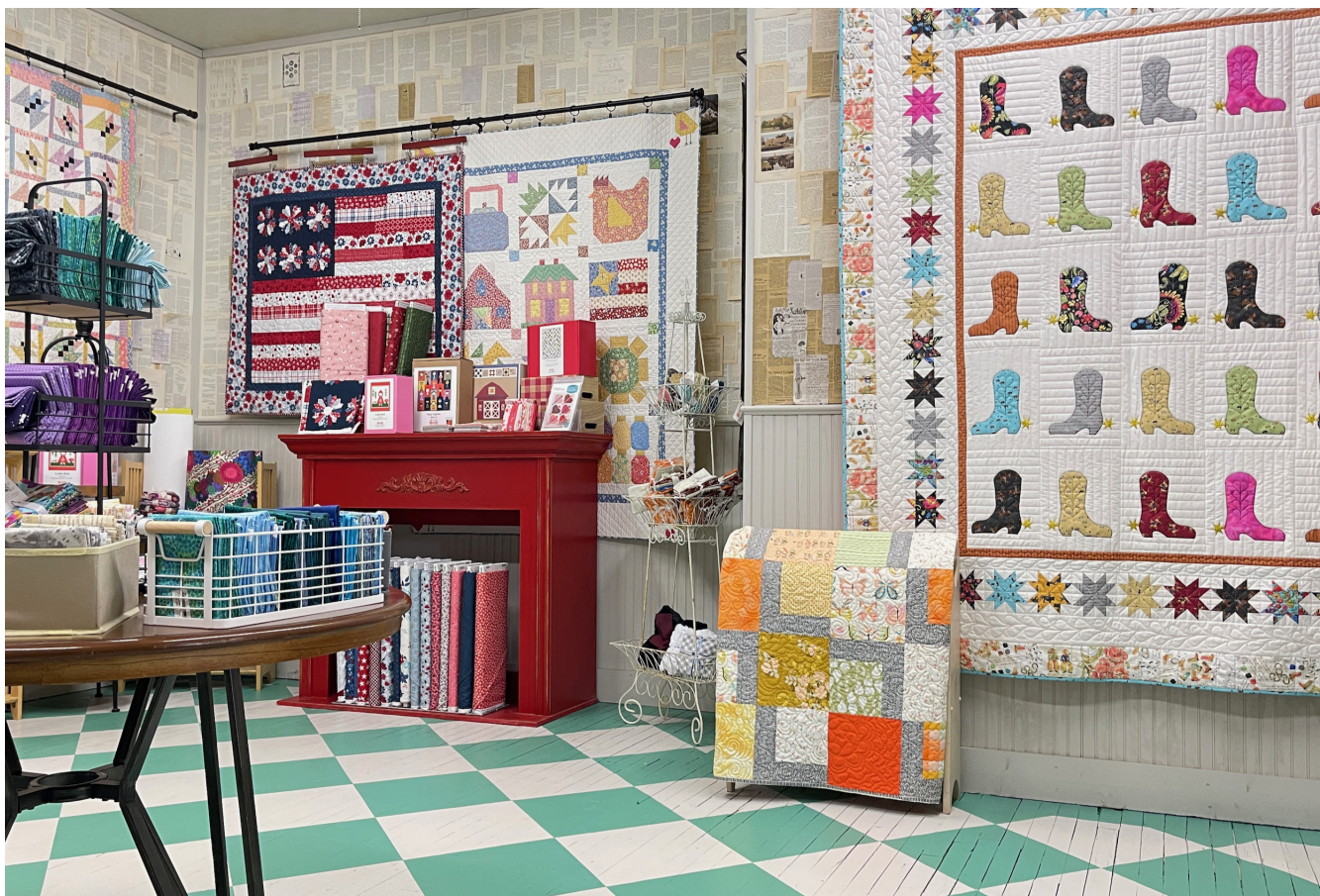
pictured Prairie Quilt's center room with walls decorated in storybook pages.

For the last five years, I have worked as a Kingfisher County Sheriff's Deputy. I am trained in crisis intervention and basic first aid and proficient in firearms. Based on my overall experience and business acumen, I believe I have what it takes to run an efficient district. I am eager to earn your support for the office of Kingfisher County Commissioner #2.