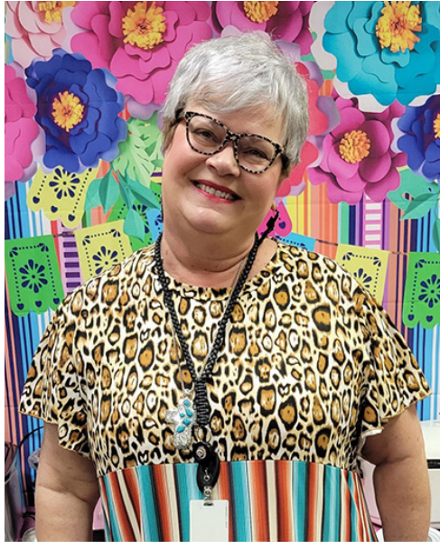
Transitions by Bonny Flesher