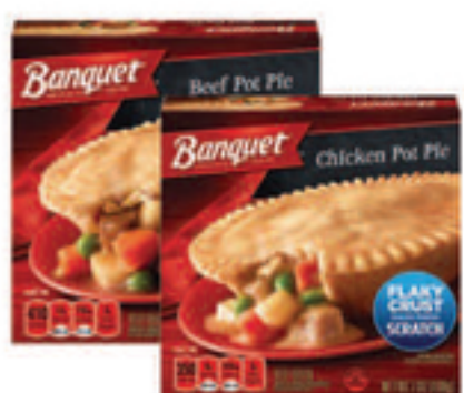
Banquet Pot Pies Select Varieties 7 oz.