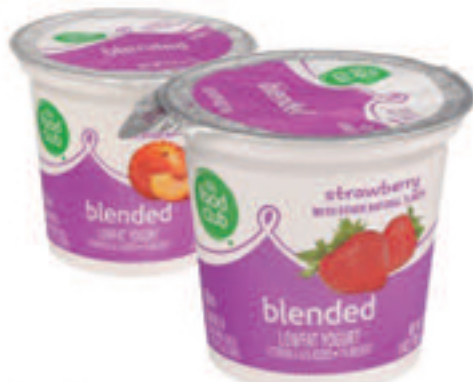
Food Club Lowfat Yogurt Select Varieties 6 oz.