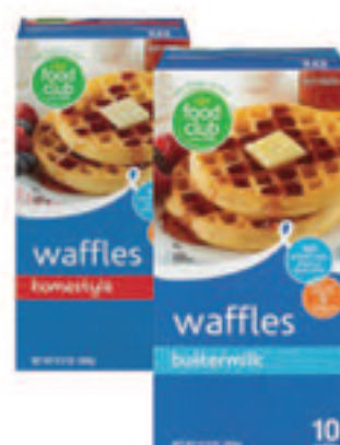
Food Club Waffles Select Varieties 10 ct.