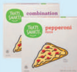
That's Smart! Pizza Select Varieties 5.2 oz.

Look for this week's SMART BUY SPECIALS!