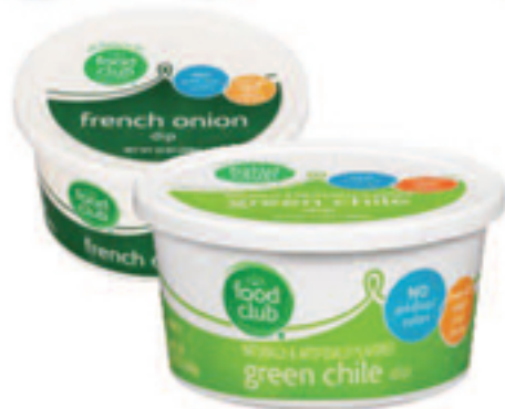
Food Club Dips Select Varieties 12 oz.