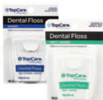
Topcare Dental Floss 100 yards Reg. or Mint