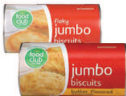
Food Club Jumbo Biscuits Select Varieties 8 ct.