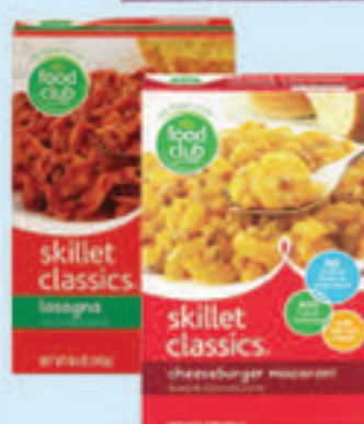
Food Club Skillet Classics Select Varieties 5.6-6.4 oz.