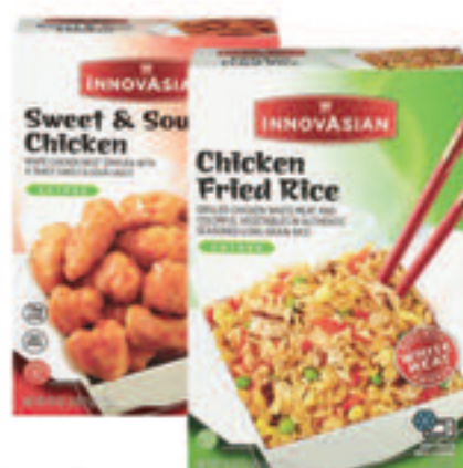
Innovasian Asian Entrees Select Varieties 18 oz.