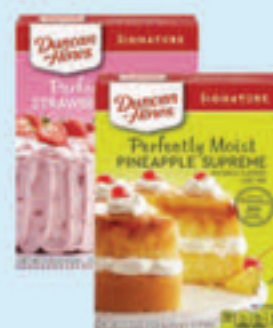
Duncan Hines Signature Cake Mix Select Varieties 15.25 oz.