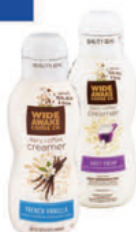
Wide Awake Coffee Co. Dairy Coffee Creamer Select Varieties 32 oz.