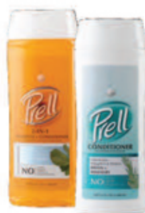
Pell Shampoo or Conditioner Select Varieties 12-13.5 oz.