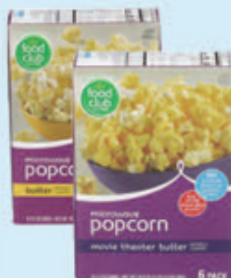
Food Club Microwave Popcorn Select Varieties 6 pk.