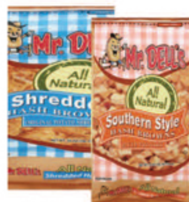
Mr. Dell's Hash Browns Select Varieties 24-32 oz.