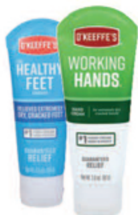
O'Keeffe's Hand or Foot Cream Select Varieties 2.7-3 oz.