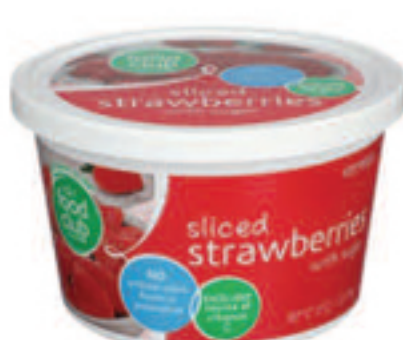
Food Club Sliced Strawberries with sugar 16 oz.