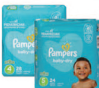
Pampers Diapers Select Varieties 21-37 ct. Jumbo Pk. Sizes 2-6