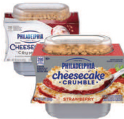
Philadelphia Cheesecake Crumble Select Varieties 2 ct./6.6 oz.