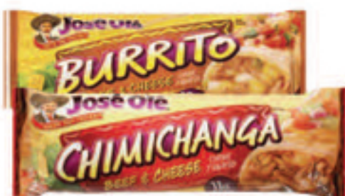
Jose Ole Burritos or Chimichangas Select Varieties 5 oz.