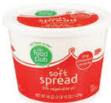
Food Club Soft Spread 4.5 oz.