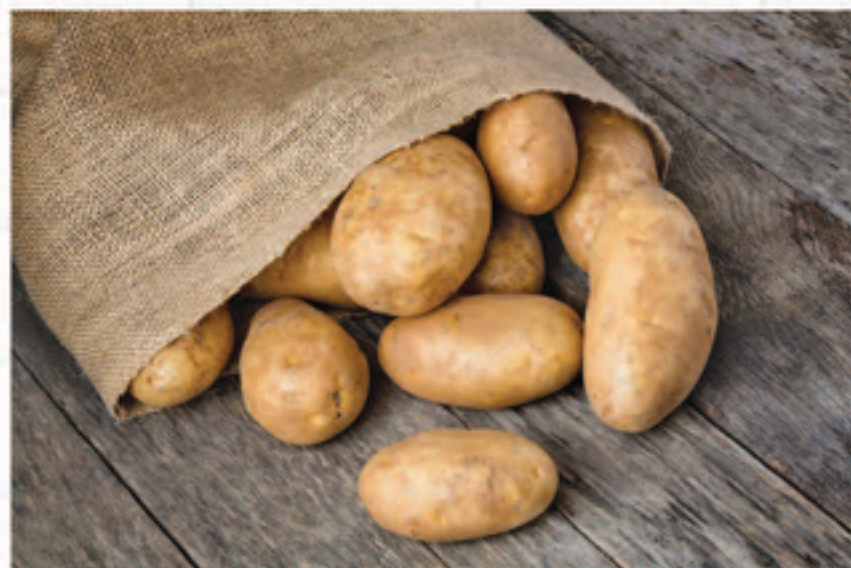
Russet Potatoes 10 lb. bag U.S. #1