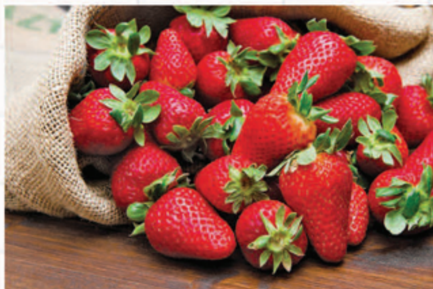
Strawberries 1 lb. pkg.