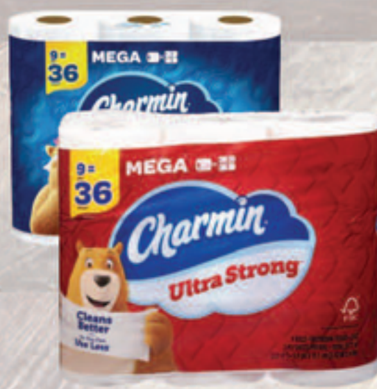
Charmin Bath Tissue 9 mega rolls Ultra Soft, Ultra Strong or Ultra Gentle