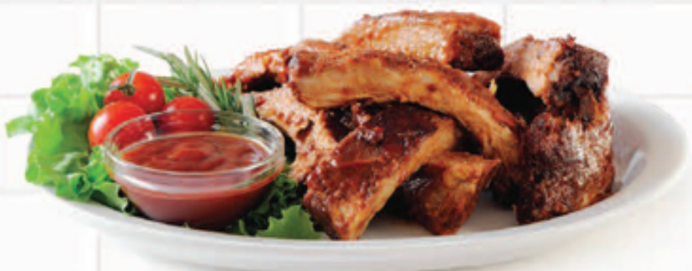
Pork Baby Back Ribs Previously Frozen