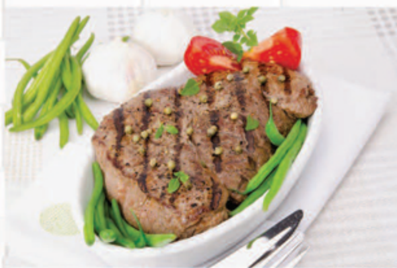
Boneless Top Sirloin Steak

Family Pack Preferred Trim Beef Single Pack... $6.17 lb. Lobster Tail 4 oz. tray with butter... $11.97