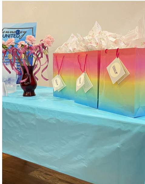
Flowers by Annie's Flowerhouse and gift bags provided by the Kingfisher County Womens group.