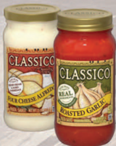
Classico Pasta Sauce Select Varieties 15-24 oz.