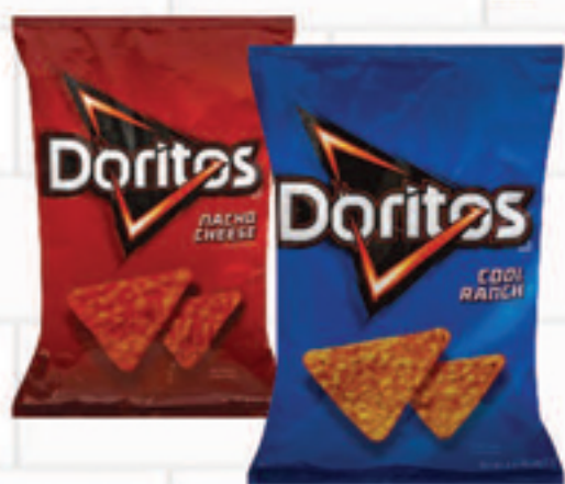
Doritos Tortilla Chips Select Varieties Reg. $6.29