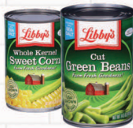
Libby's Vegetables Select Varieties 14.5-15.25 oz.