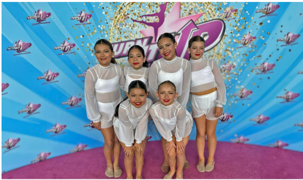
RedLevé Competitive Dance Team performs at Turn It Up Dance Challenge at the Oklahoma City Convention Center. Receiving High Gold Ratings for 3 performances.