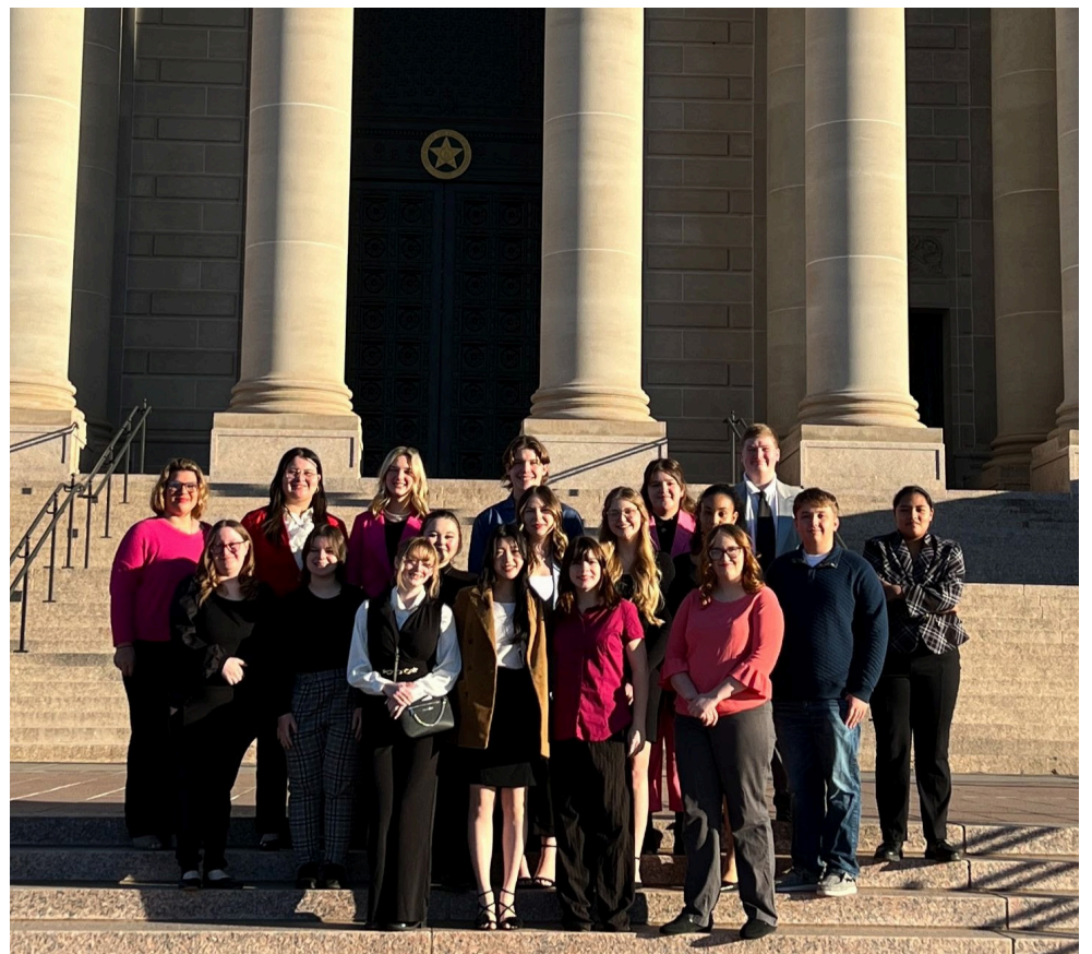
Y AHL youth members at the State Capitol

On Tuesday, February 20th, a group of members from the Youth Advocates for Health and Liberty (Y AHL) took a significant step towards promoting the CounterAct Tobacco campaign by visiting the Oklahoma State Capitol. Eighteen dedicated young individuals seized the opportunity to advocate for comprehensive tobacco retail licensing in their communities, aiming to combat the growing concerns around vaping and tobacco use among Oklahoma's youth.