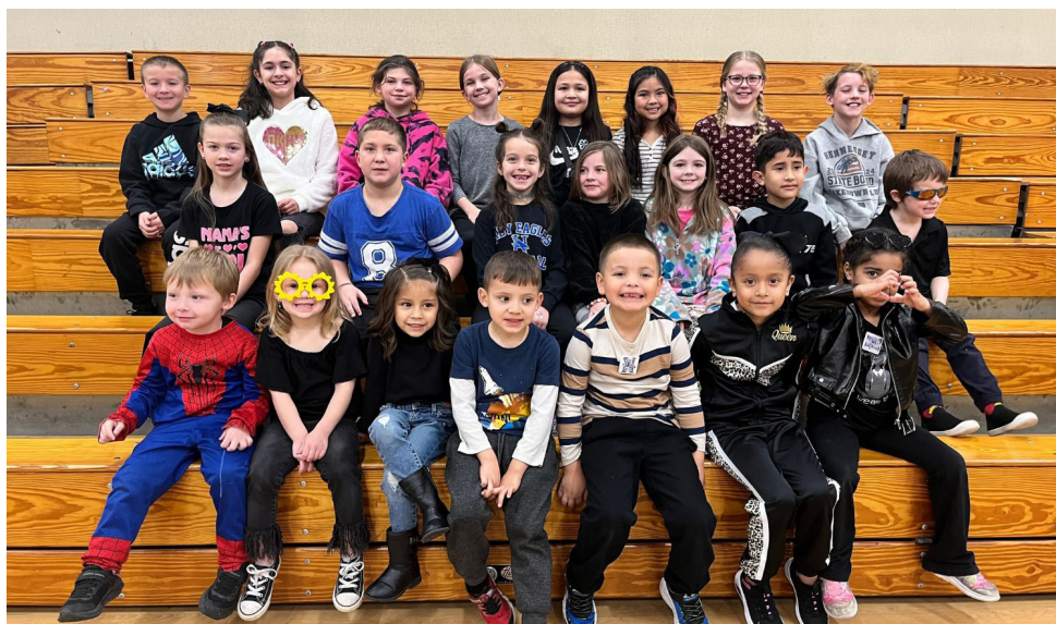
CONGRATULATIONS TO THESE STUDENTS OF THE WEEK March 1