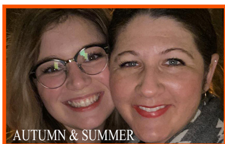
AUTUMN & SUMMER