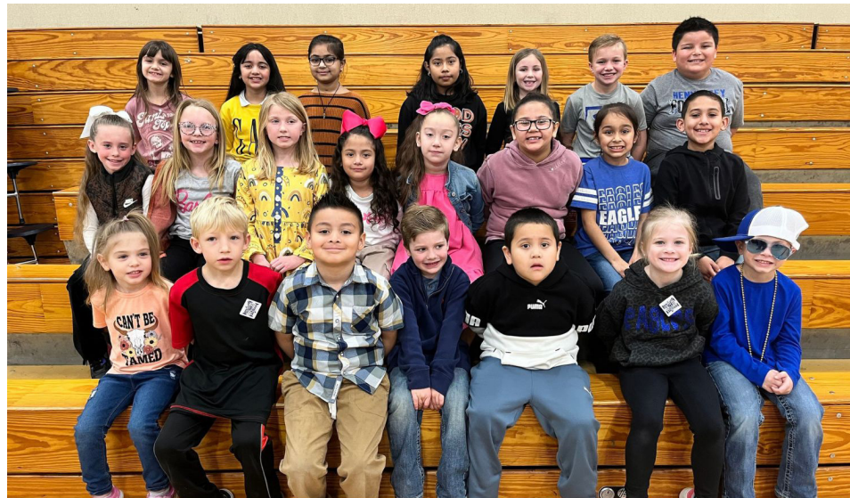
CONGRATULATIONS TO THESE STUDENTS OF THE WEEK 2/23

108 N Main Street, Hennessey 405-853-2103