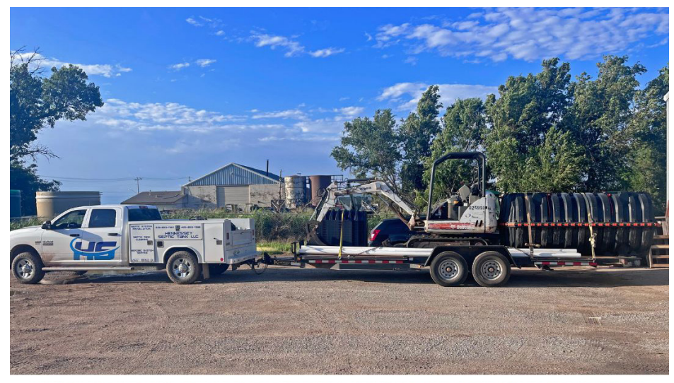
NO MATTER HOW HARD THE JOB IS, HENNESSEY SEPTIC CAN GET IT DONE RIGHT! FOR ALL YOUR SEPTIC NEEDS CONTACT HENNESSEY SEPTIC.