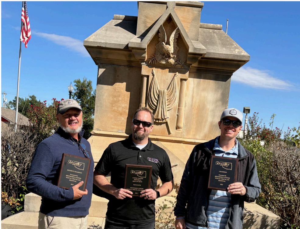
The winners of the Wine Festival secret judges included: Best of Show (Center) Curtis Turner Memorial Best of Show- Put a Cork In It Winery, 2nd place - Wildhorse Canyon Farms Winery, (on the right), and 3rd place- Shakespeare Wine Company. (On the left)