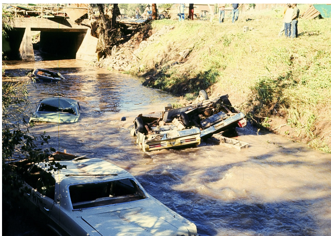
Enid the day after the big flood near St Mary's Hospital.

on October 11. The Cimarron River at Dover eventually crested at 21 feet; the all-time record is 24 feet which occurred in the 1957 flood. The Dover bridge over the river was destroyed as well as much of Highway 81 between Dover and the river. The waters took out the entire railroad bridge west of Dover. Rebuilding that damage took months and months of intense work to complete.