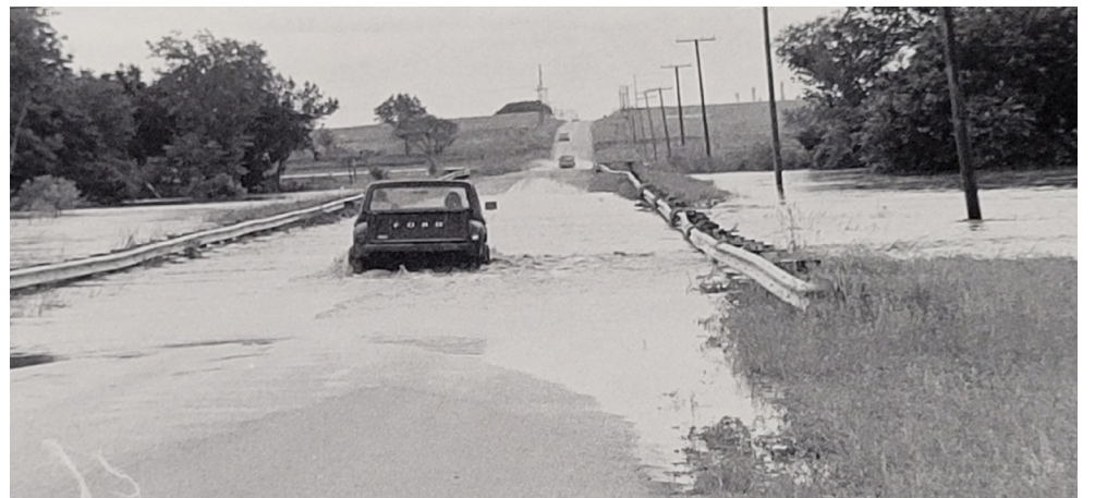
Flood waters south of Hennessey.

The flooding did no damage in Hennessey itself, but Enid suffered greatly, and in Dover, nearly all buildings—homes and businesses—except the school were damaged. Kingfisher also saw flooding