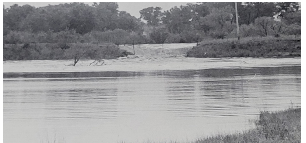
Flood waters south of Hennessey.

Oklahoma weather is always unpredictable. One never knows what to expect. However, no one expected the sweeping flood of 1973, a flood for the ages and the record book, even now 50 years later. Thankfully, our community was in comparison to Enid and Dover in particular unscathed in the disaster. The power of water is dangerous, destructive, and deadly. Quick thinking and concerned neighbors saved the day for many outlying Hennessey residents, taking chances with their property and lives to protect others' property and lives. That's the way America should run—and still does, at least in Hennessey. Lord knows we need rain, but we certainly don't need a repeat of October 10 and 11, 1973.