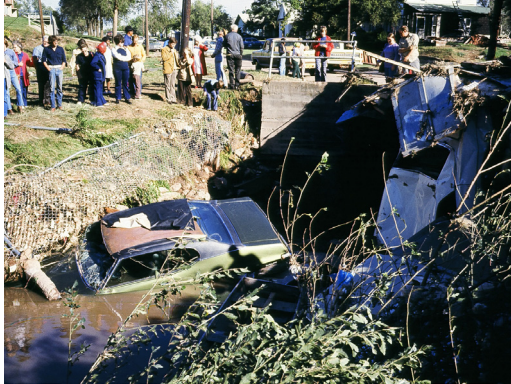
Enid the day after the big flood near St Mary's Hospital.

When the flood waters from Turkey Creek had gathered themselves some six hours after the rain started, it swept everything away in front of it, including about 8 inches of top soil, removing soil down to the plow pan level on its race to the Cimarron. It destroyed the Turkey Creek bridge west of Hennessey on Highway 51 at 2:30 a.m.