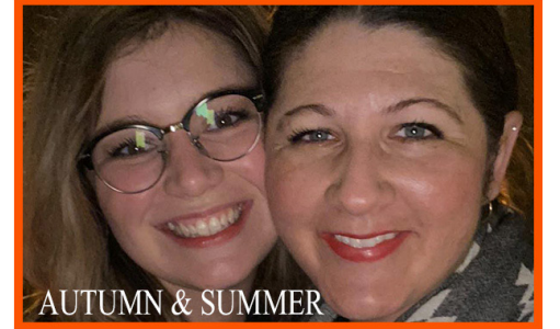
AUTUMN & SUMMER