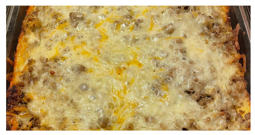
just comes up with the most simple, tasty meal ideas! Not saying she's lazy buttttt...if a recipe is more than 5 steps, she's out! haha! We were talking about breakfast casseroles and she decided to make a Crockpot breakfast casserole if Crockpot recipes are more your jam... If your Crockpot makes you happy then we are here for you!

Autumn's specialty is to find shortcut recipes. It comes naturally for her..she