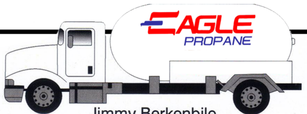
Jimmy Berkenbile Owner

P.O. Box 6 - Hennessey, OK 73742 eaglepropane@pdi.net