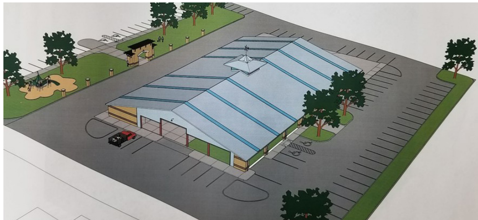
This is a rendering of what The John Deutschendorf Memorable Pavilion could look like when all phases are complete.

The first item the board approved is the new Pavilion that will be built on the old lumber yard site on West 1st Street. The Pavilion will be built in stages. Stage one will include a 50x100 structure with a roof and no sides at this time. This will be built with all-new steel and will be constructed by Hennessey Metal Building at no charge, but for naming rights. It will be called "The John Deutschendorf Memorable Pavilion."