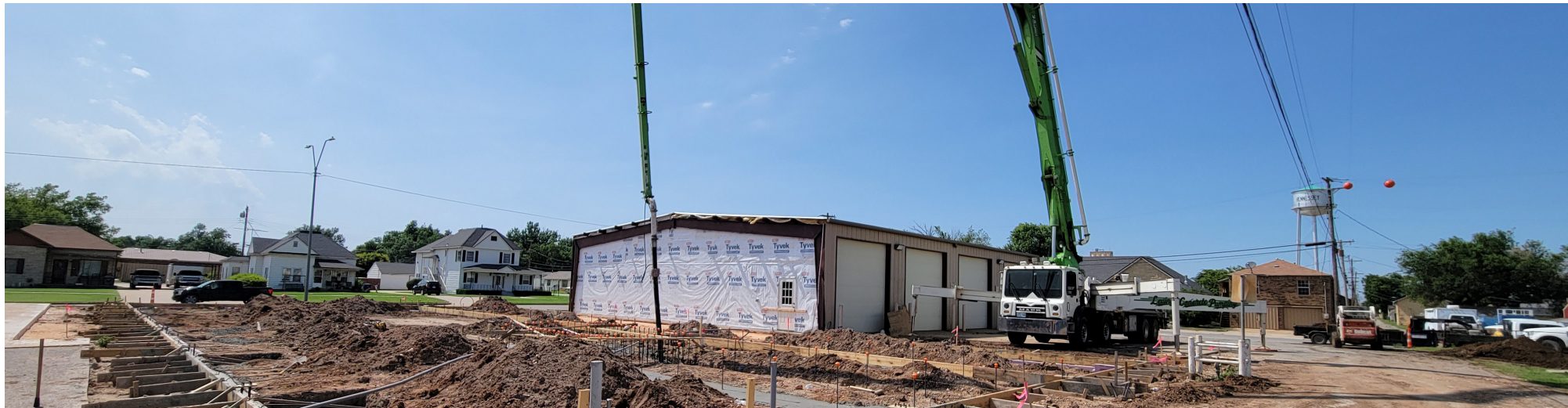
The Hennessey Fire Station improvements are in full swing with demo complete the first concrete for the foundation was poured on Thursday, June 16th. The construction company has been dealing with all the rain lately but appears to be on schedule.