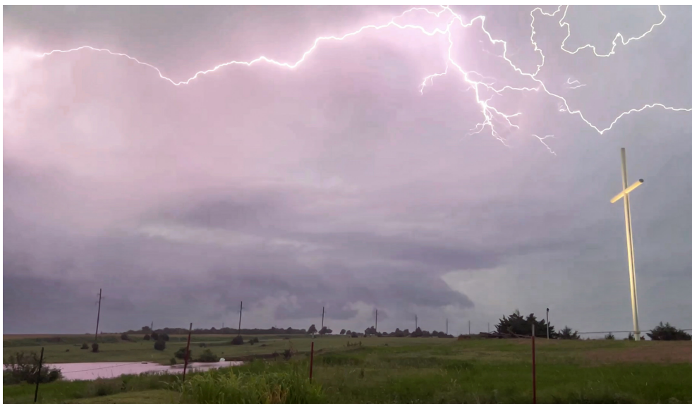
Lightning captured during the storms June 17th

So far this summer, Hennessey has experienced its share of severe weather. It seems like we have had a severe storm almost daily this month and Last Saturday night (June 17, 2023) was no different. Hennessey was pounded by 80 MPH winds when a fast-moving severe thunderstorm moved through the area at about 10:30 pm. There was some minor small tree damage and flooding. A boat blew into the road at 436 N Oak and a truck spun out of control and ended up in a ditch near 7th St and S Mitchell Rd. Other than that no major damage was reported.