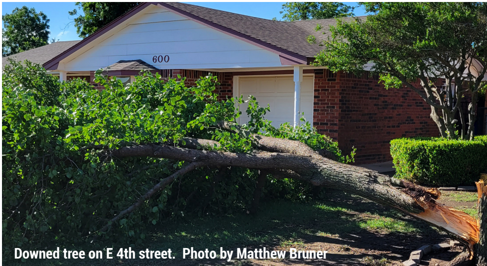
Downed tree on E 4th street.