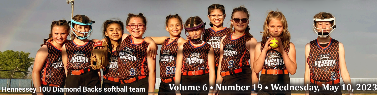
Hennessey 10U Diamond Backs softball team

Volume 6 • Number 19 • Wednesday, May 10, 2023